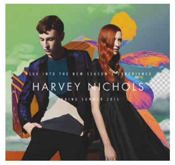
Spring / Summer 2015 fashion at Harvey Nichols. 於「Harvey Nichols」的二零一五年春/夏季時裝。

In view of these results, the Board is recommending the payment of a final dividend of HK6.0 cents per ordinary share, compared to a total dividend of HK31.0 cents per ordinary share in the previous year.