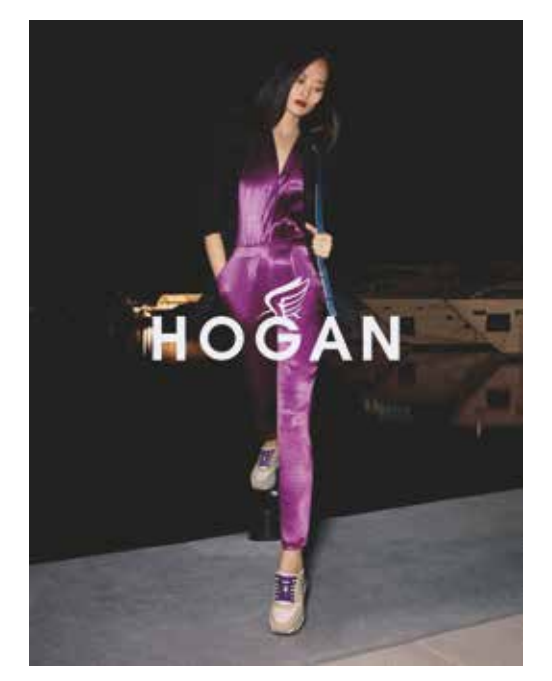
Handbag and shoes by Hogan. 「Hogan」 手袋及鞋履。