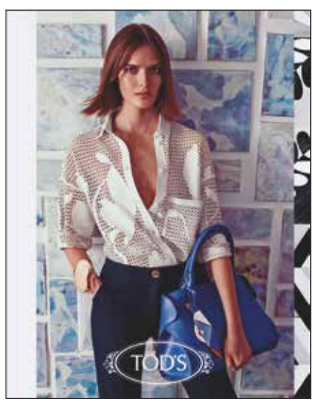
Tod's handbag. 「Tod's」 手袋。