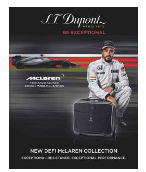
S.T. Dupont 'NEW DEFI McLAREN COLLECTION' leathergoods. 「都彭」的「NEW DEFI McLAREN COLLECTION」皮具。