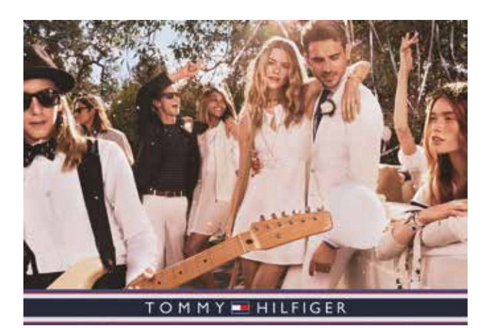
Fashionwear by Tommy Hilfiger. 「Tommy Hilfiger」時裝。