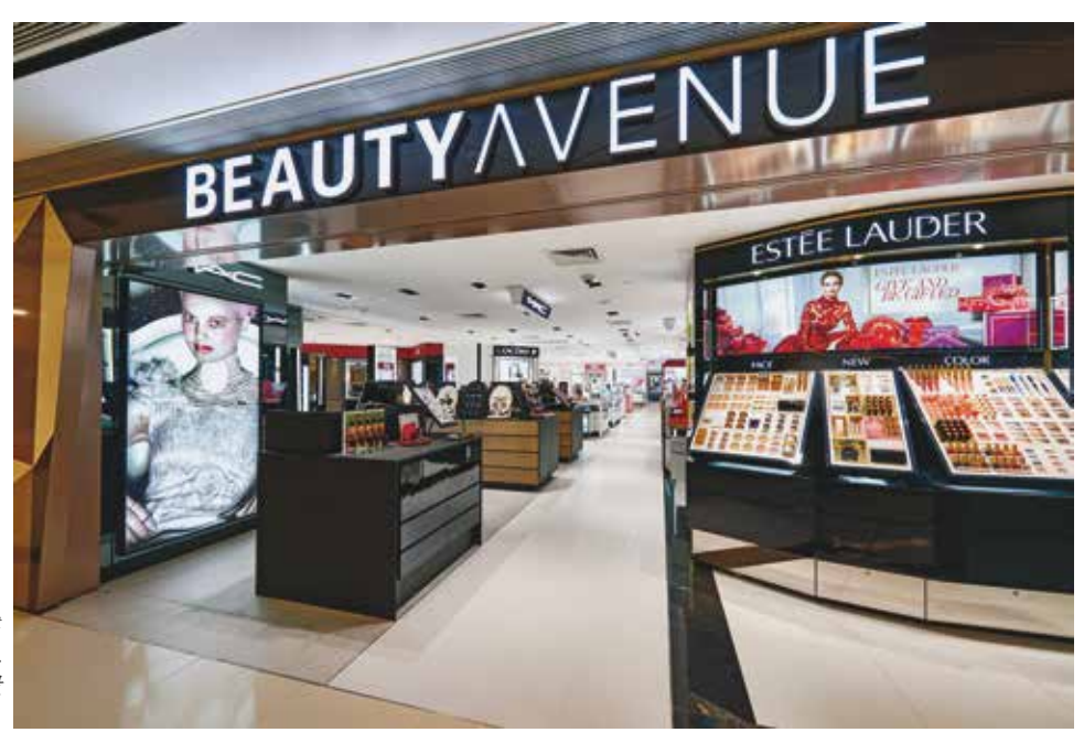
Newly opened Beauty Avenue store at Tsuen Wan Plaza, Tsuen Wan, Hong Kong. 位於香港荃灣荃灣廣場新開設 的 「Beauty Avenue」 店。