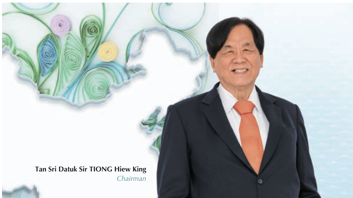
Tan Sri Datuk Sir TIONG Hiew King Chairman

Financial year 2014/15 was characterised by uncertainties in terms of both the political environment and domestic market for Hong Kong. The performance of One Media Group Limited (the “Company”) and its subsidiaries (collectively, the “Group”) was therefore impacted by this tough business environment. In addition, the Group recognised substantial impairment provisions on its interest in an associate and the goodwill arising from the acquisition of the Group’s subsidiaries in Mainland China in 2004. As a result, the Group reported a loss for the financial year ended 31st March 2015 as compared to the profit attributable to equity holders for the last financial year.