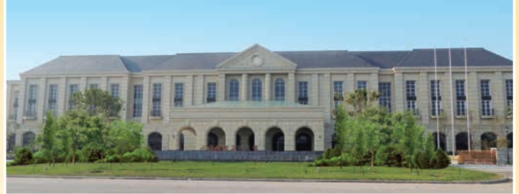
Tianjin cellar 天津酒窖