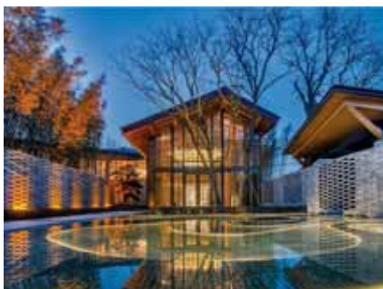
蘇州北辰旭輝壹號院 Suzhou North Star CIFI No.1 Courtyard