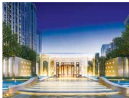
南京北辰旭輝鉅悅金陵 Nanjing North Star CIFI Park Mansion Jin Ling