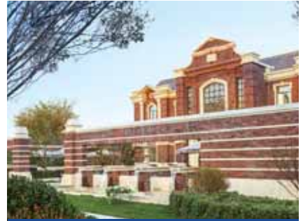
天津旭輝御府 Tianjin CIFI Private Mansion