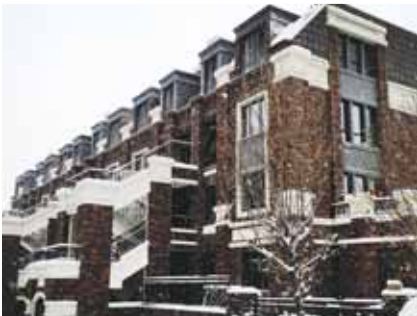
天津旭輝燕南園 Tianjin CIFI Yannan Garden