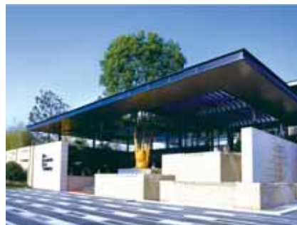
杭州綠地旭輝城 Hangzhou Greenland CIFI Glorious City