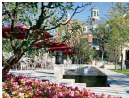
北京當代旭輝墅 Beijing MOMA CIFI Residence