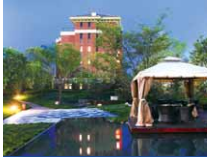
北京旭輝御錦 Beijing CIFI The Upper House