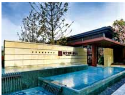
杭州順發旭輝國悅府 Hangzhou Shunfa CIFI Honor Mansion