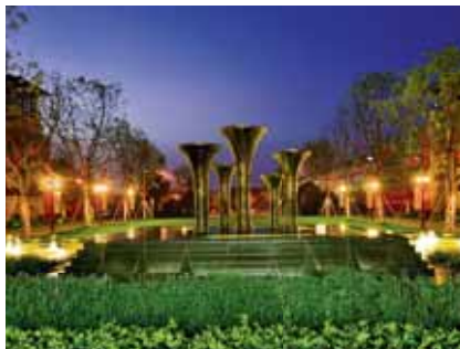
武漢旭輝御府 Wuhan CIFI Private Mansion