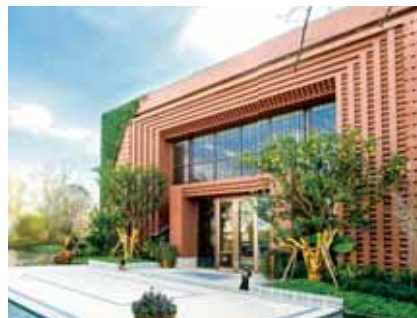
蘇州旭輝香格裡 Suzhou CIFI Shangli