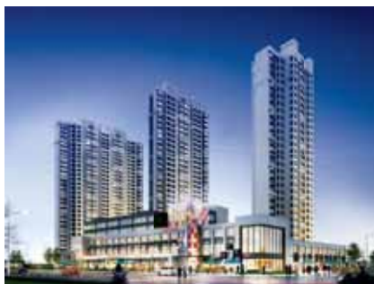
南京旭輝九著 Nanjing CIFI Nine Modern Life