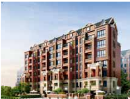
長沙旭輝國際廣場 Changsha CIFI International Plaza