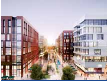
北京旭輝26街區 Beijing CIFI No.26 Block