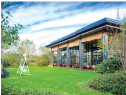
蘇州恆基旭輝城 Suzhou Henderson CIFI City