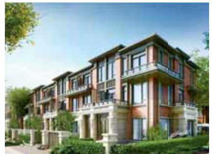
武漢鈺龍旭輝半島 Wuhan Yulong CIFI Peninsula