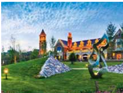
合肥旭輝湖山源著 Hefei CIFI Original Villa