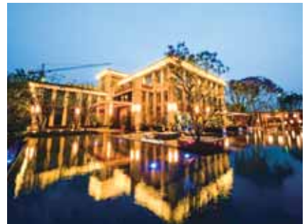
重慶旭輝城 Chongqing CIFI City