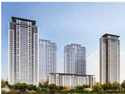
南京旭輝鉅悅秦淮 Nanjing CIFI Park Mansion Qin Huai