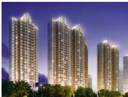
合肥旭輝御府 Hefei CIFI Private Mansion