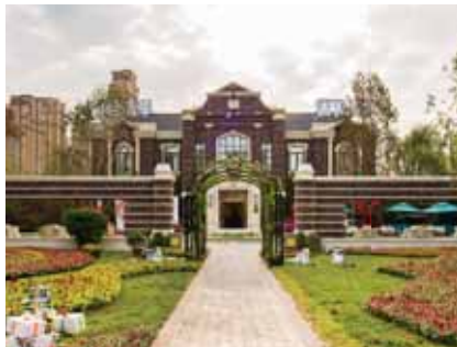
瀋陽旭輝御府 Shenyang CIFI Private Mansion