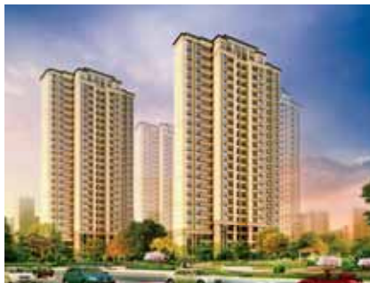
蘇州旭輝壹悅 Suzhou CIFI Xiyue