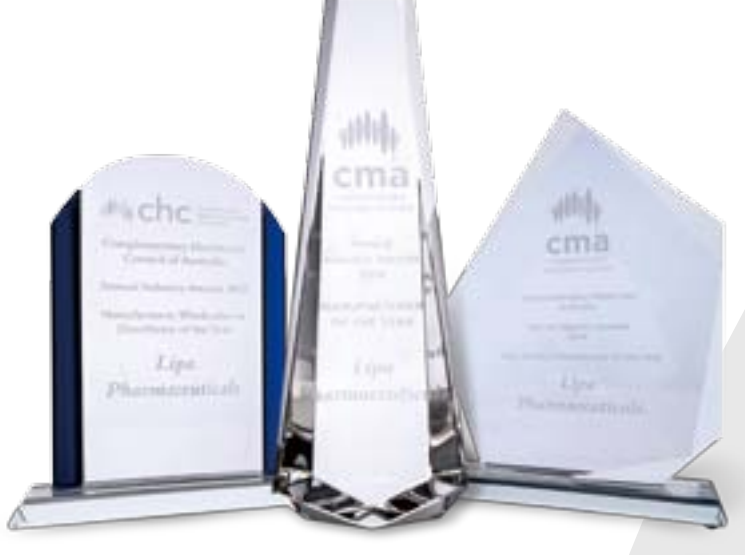
Lipa was named by Complementary Medicines Australia as the "Manufacturer of the Year" in 2015.