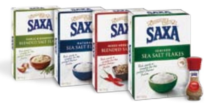
Cheetham sells its products domestically in Australia, New Zealand and Indonesia, and exports to Japan, Taiwan, South Korea and China.

With a production capacity of approximately 800,000 tonnes of crude salt, Cheetham has the ability to convert up to 600,000 tonnes of crude salt into refined salt per year.