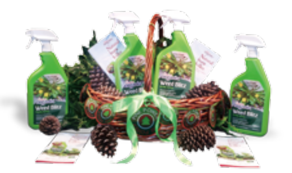
Amgrow serves Australia's home garden, golf and turf, horticulture, as well as pest and broadacre markets.

Amgrow Pty Ltd ("Amgrow") is an Australian business which serves the country's home garden, golf and turf, horticulture, as well as pest and broadacre markets through four discrete business units: (i) home garden; (ii) agriculture/horticulture; (iii) golf and turf; and (iv) pest control.