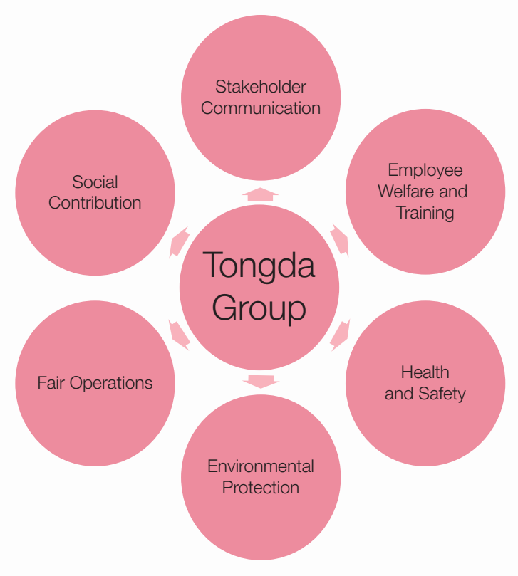
Tongda Group's CSR Model

The contents contained in this standalone of Environment, Social and Governance ("ESG") report include the information obtained through a number of channels from shareholders, stakeholders and various parties over the year. The report covers workplace quality, environment protection, operating practices and community involvement aspect and Corporate Social Responsibility ("CSR") Model. We have given full consideration to issues that are concerned about by major stakeholders, and adhered to the principles of materiality, completeness, comparability and stakeholder involvement, whereby the substances of this ESG report are determined. This report spans over a period from 1 January 2015 to 31 December 2015, and covers information of the Group – Hong Kong headquarters and the production bases in China, such as Shishi (石獅), Xiamen (廈門), Changshu (常熟), Shenzhen Baoan (深圳寶安), Shenzhen Shajin (深圳沙井), Nanan (南安) and the research and development centres in Taiwan, Kaohsiung (台灣高雄) and Shanghai (上海). This report provides detailed explanation with regard to the Group's CSR model on different aspects, including working environment quality, employee welfare and training, health and safety, environment protection, operating practices, community involvement and stakeholder communication. Tongda Group's CSR model is set out as follows.