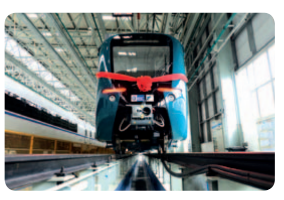
• EMUs for the Brazil Rio Olympics are fully delivered