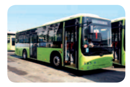
18 new energy passenger carriages are driven to the southernmost of Mainland China