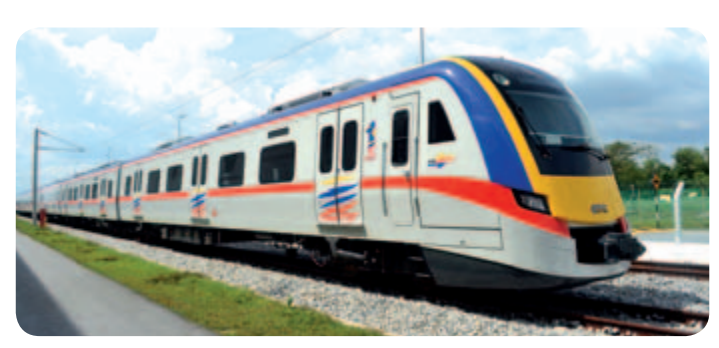
18-metre energy-storage modern light rail vehicle

By capturing the sound opportunity in the rapid development of the domestic urban rail transit and centering around the theme of "integration and innovation, synergy and development", the Company expanded its businesses, reinforced management and endeavoured to foster the overall competitive advantages of rapid transit vehicles business for continuous expansion of the domestic and international rapid transit vehicles markets. In the domestic market, led by market direction and focusing on customer needs to provide systematic solutions by optimizing product technology and lifespan of service, aimed at key areas including the Yangtze River Delta and the Pearl River Delta to reinforce coordination and management for continuous expansion of the ability to obtain more orders and develop the market, the Company deepened innovation in its business model, strengthened communication and cooperation with local government, and strengthened the effort to develop a rapid transit engineering market, which provided a solid foundation for further expansion of general contracting of projects.