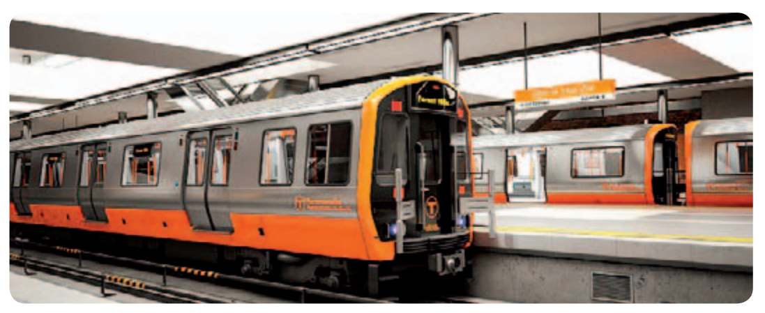
Metros in Boston, U.S.

Mitigants: with respect to expansion of the international market, proactively conduct investigations related to the international market; timely and accurately know the changes in demands and policies of the international market and propose countermeasures. When investing in the overseas market, global political, economic, social and environmental factors will be considered; efficient investment and operation teams will be formed; pre-investment risk assessment and due diligence investigation will be conducted and high-risk businesses will be strictly controlled with proper post-investment management. Attention will also be paid to human resources, environment and culture integration issues.