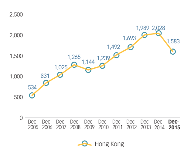
Group by locations – No. of Consultants & Trainees