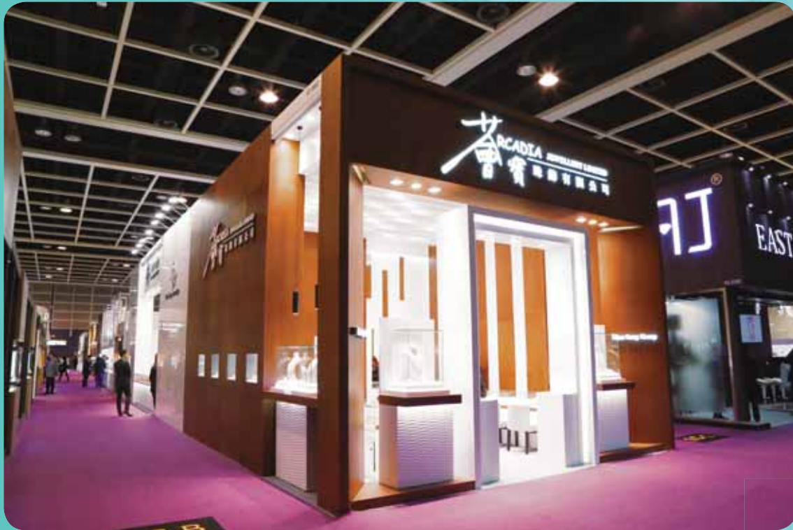
Photo taken in Hong Kong International Jewellery Show 拍攝於香港國際珠寶展