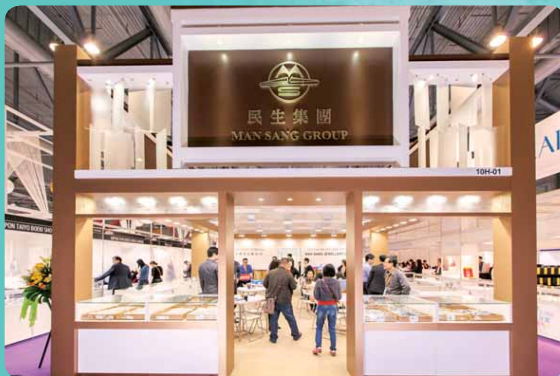
Photo taken in Hong Kong International Jewellery Show 拍攝於香港國際珠寶展