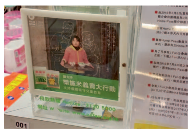
6. The Group participated in Oxfam Rice Sale Campaign organized by Oxfam Hong Kong.