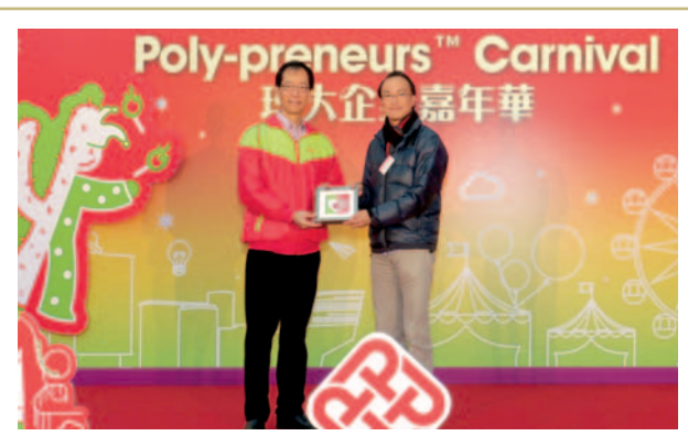
5. The Group sponsored the "Poly-preneurs Carnival".