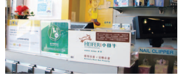
4. Various donation boxes of different non-profit making organizations, including ORBIS and Heifer International – Hong Kong, are placed at designated stores of the Group.