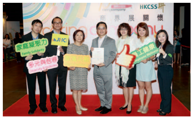
1. The Group has been granted the Caring Company honor again for consecutive 10 years by HKCSS on 10 May 2016.