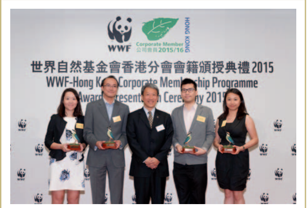
8. The Group has become the corporate Silver Member of WWF (Hong Kong) since 2006.