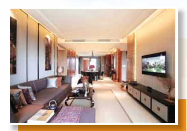
Agile Cambridgeshire Guangzhou 廣州雅居樂劍橋郡