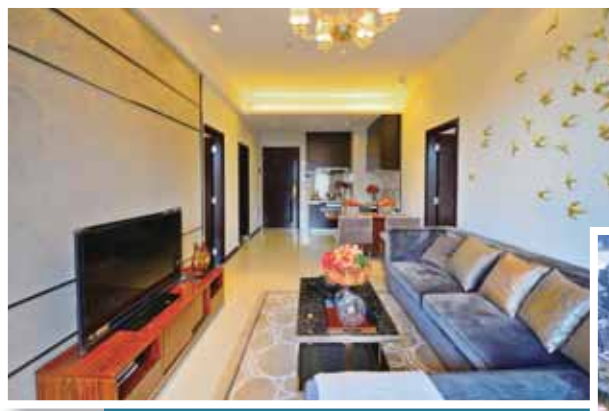
Agile Cambridgeshire Zhongshan 中山雅居樂劍橋郡