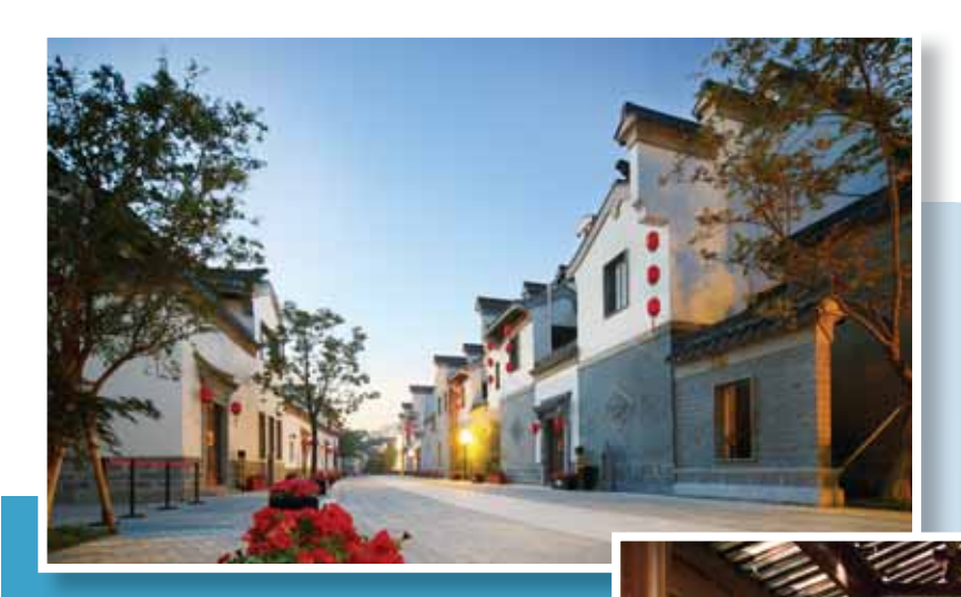
Agile Chang Le Du Nanjing 南京雅居樂長樂渡