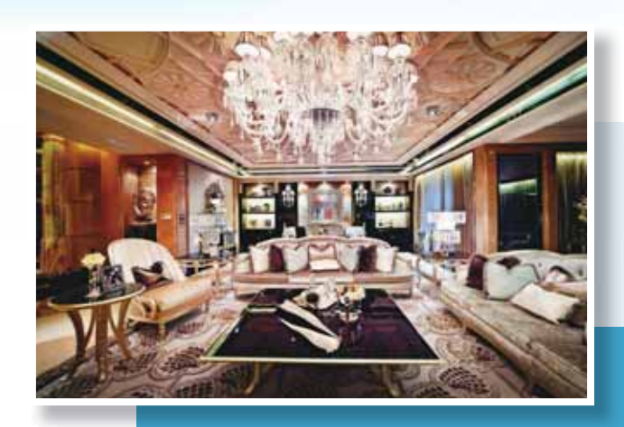
Agile Chairman Chongqing 重慶雅居樂御賓府