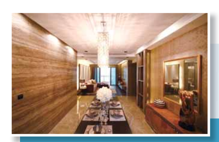
Agile Mountain Guangzhou 廣州雅居樂富春山居