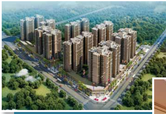
Agile Personage Nanhai 南海雅居樂御景豪庭