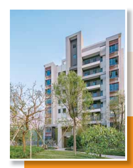
Agile Coastal Pearl Zhongshan 中山雅居樂山海郡