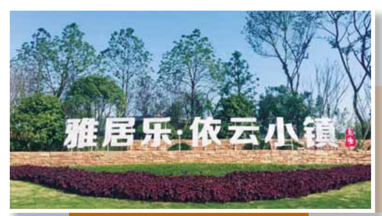
Agile Evian Town Changsha 長沙雅居樂依雲小鎮