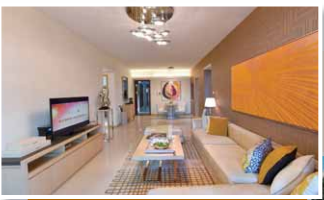
Agile British Manor Shunde 順德雅居樂英倫首府