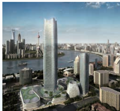
Shanghai Sinar Mas Plaza 上海白玉蘭廣場