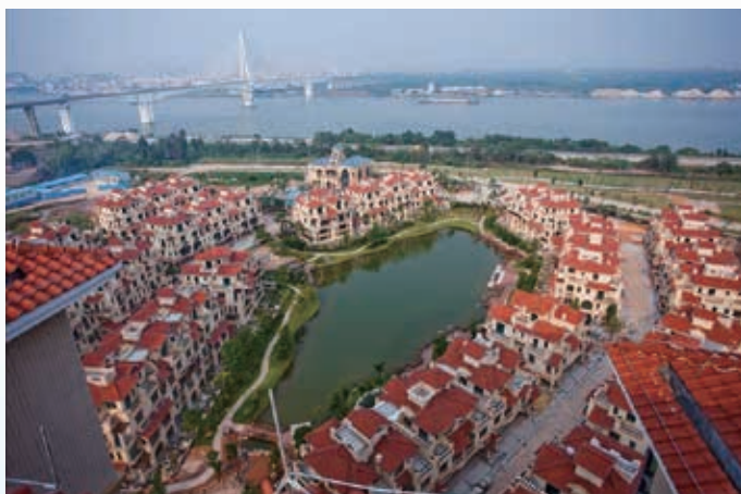
Jiangmen Eka Garden 江門奕聰花園

政府將繼續支持風電行業，以減少污染。於二零一六年初，政府宣佈一項政策，當中規定，為達致截至二零二零年非化石燃料能源發電佔15%及截至二零三零年佔30%的目標，截至該等年份，各省必須滿足最低可再生能源配額。隨後，國家能源局發佈五月三十一日公告，宣佈電網公司須確保限電省份的風力發電場獲得最低利用小時。此外，新突高壓輸電線路繼續建設，預計將於二零一七年完成，此線路對減少限電可能帶來幫助。