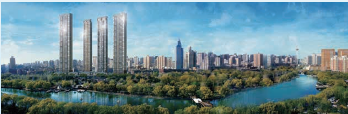
Shenyang Eka Garden 瀋陽奕聰花園

瀋陽市場環境於二零一六年備受供過於求影響而低迷。然而，二零一七年有緩和跡象。於二零一六年，本集團售出樓面總面積25,281平方米，合約銷售額為人民幣285,200,000元，較二零一五年同期人民幣212,000,000元增長35%。