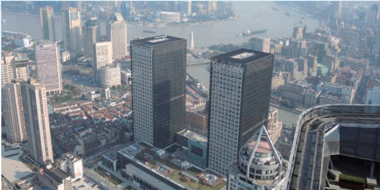
Shanghai Landmark Center 上海星薈中心