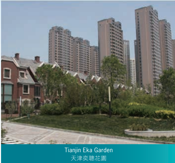
Tianjin Eka Garden 天津奕聰花園