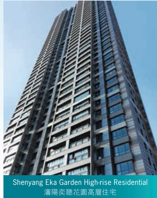
Shenyang Eka Garden High-rise Residential 瀋陽奕聰花園高層住宅

Most of the Group's outstanding borrowings take the form of interest-bearing loans, with floating interest rates.