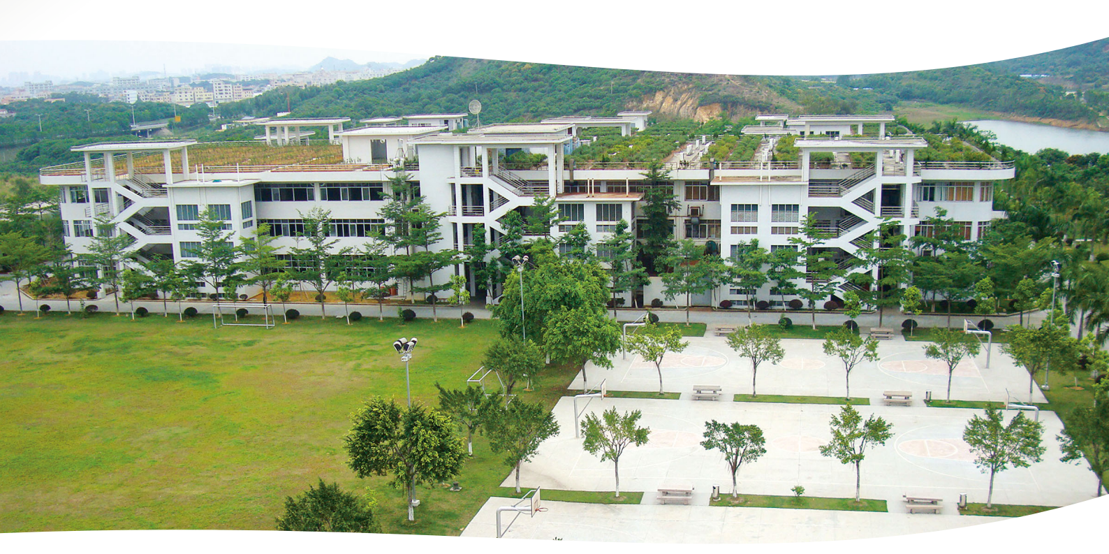
The Dongguan Dalang factory