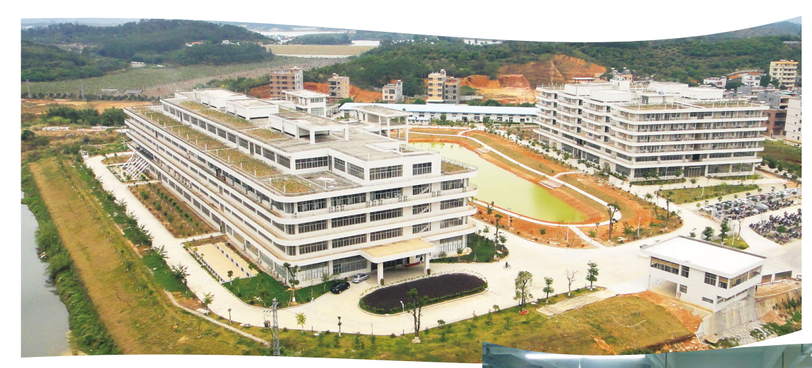
The factory and dormitory buildings at Dongfeng Village, Huzhen, PRC.