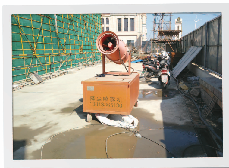
▲ atomisers for dust suppression installed in the construction site of The Cullinan Bay project

With a view to preventing dust pollution and improving air quality in the city to safeguard the health of the city dwellers, atomisers for dust suppression are installed in the construction site of The Cullinan Bay project to control dust pollution. This type of atomiser for dust suppression is characterized by the large reduction in water use as compared with the traditional wet dust extraction. Contractors are engaged to transport the construction waste from the construction site of the project to the landfill at Touqiao Town for disposal everyday.