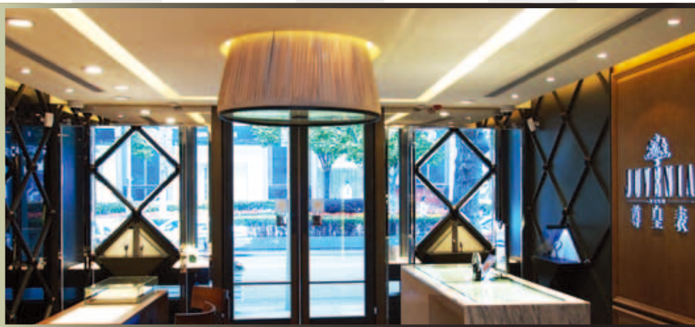
冠亞名表城 上海 南京西路 尊皇、豪門世家 專賣店 Timecity Shanghai Nanjing Road West Juvenia / Sarcar Boutique