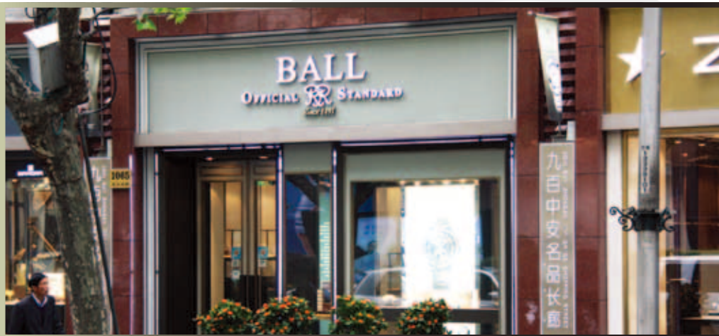
冠亞名表城 上海 南京西路 波爾 專賣店 Timecity Shanghai Nanjing Road West Ball Boutique