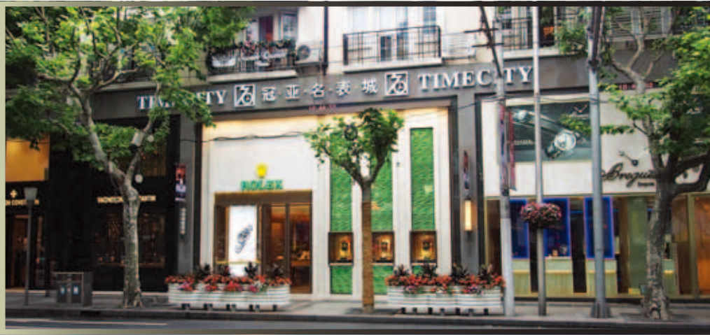
冠亞名表城 上海 南京西路 江詩丹頓、 勞力士、寶璣 專賣店 Timecity Shanghai Nanjing Road West Vacheron Constantin / Rolex / Breguet Boutique