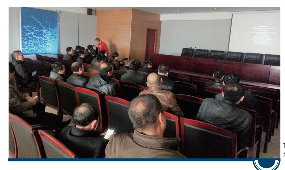
The training 培訓現場情況

隨著本集團不斷發展,為確保團隊質素不斷提升,我們將增加員工接受培訓的機會,並不斷檢視及改進培訓課程,使其配合業務營運及員工的需要。