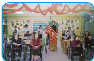
Previous Tsz Wan Shan Pine Care Elderly Home 前慈雲山松齡護老院

Began participation in the Enhanced Bought Place Scheme 開始參與改善買位計劃