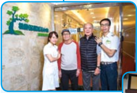
Pine Care (Po Tak) Elderly Centre 松齡 (保德) 護老中心