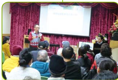
Established Quality Assurance Monitoring Committee 成立優質服務監察委員會