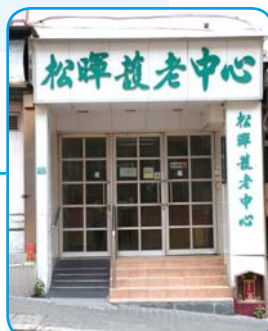
Pinecrest Elderly Centre 松暉護老中心