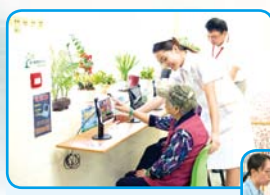
New Pine Care Centre 新松齡護老中心