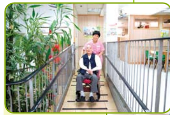
Pine Care Hong Fai Elderly Centre 松齡康輝護老中心