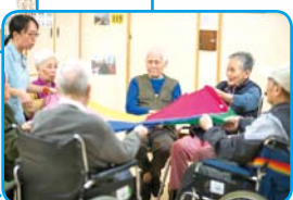
Pine Care (Lee Foo) Elderly Centre 松齡 (利富) 護老中心