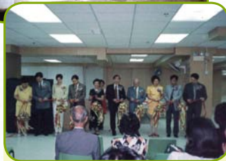
Previous New Pine Care Centre 前新松齡護老中心