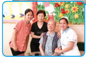
Pine Care (Manning) Elderly Centre 松齡 (萬年) 護老中心