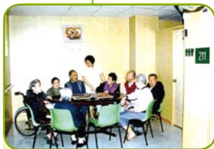
Pine Care's first care and attention home — Previous Pine Care Centre 松齡的第一間安老院舍 — 前松齡護理安老院