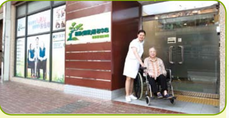
Pine Care (Tak Fung) Elderly Centre 松齡 (德豐) 護老中心