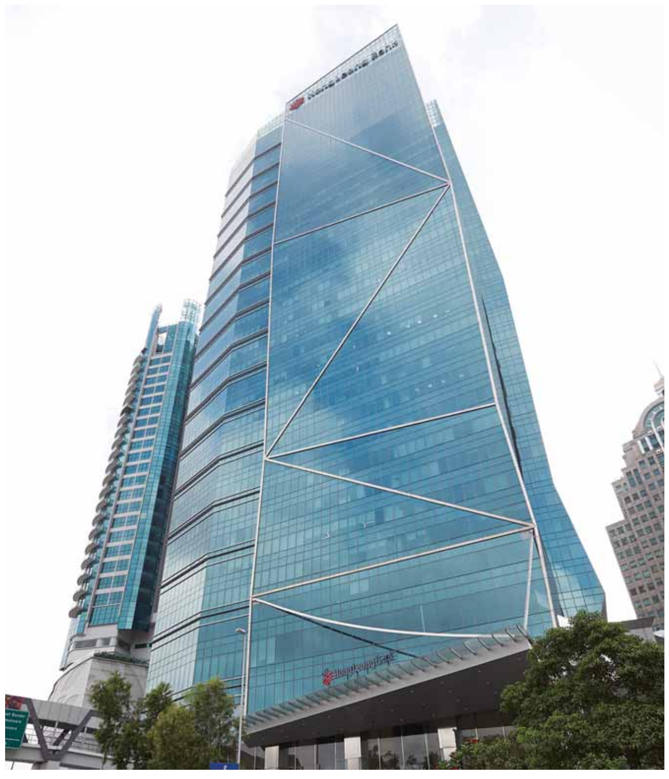
Headquarters of Hong Leong Bank Berhad, Kuala Lumpur