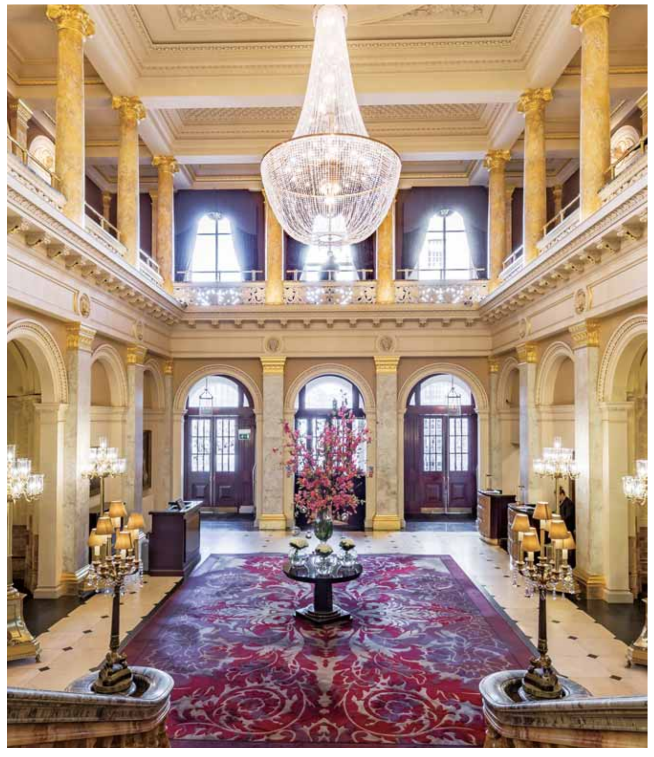
Lobby of The Grovsenor Hotel, London