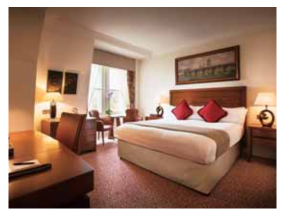
River facing room of The Royal Horseguards Hotel, London

Revenue decreased by 1% year-on-year to US$344.4 million due mainly to lower revenue generated by hotel and oil and gas segments. Hotel revenue was lower compared to last year as a result of fewer rooms available for sale due to the refurbishment of The Cumberland. However, the strengthening of GBP (increased by 6% year-on-year) against USD had mitigated the impact. Lower revenue from oil and gas segment compared to the previous financial year was due to lower oil and gas production despite an increase of 19% year-on-year in the average crude oil price. The increase in cost of sales was mainly due to the strengthening of GBP against USD.