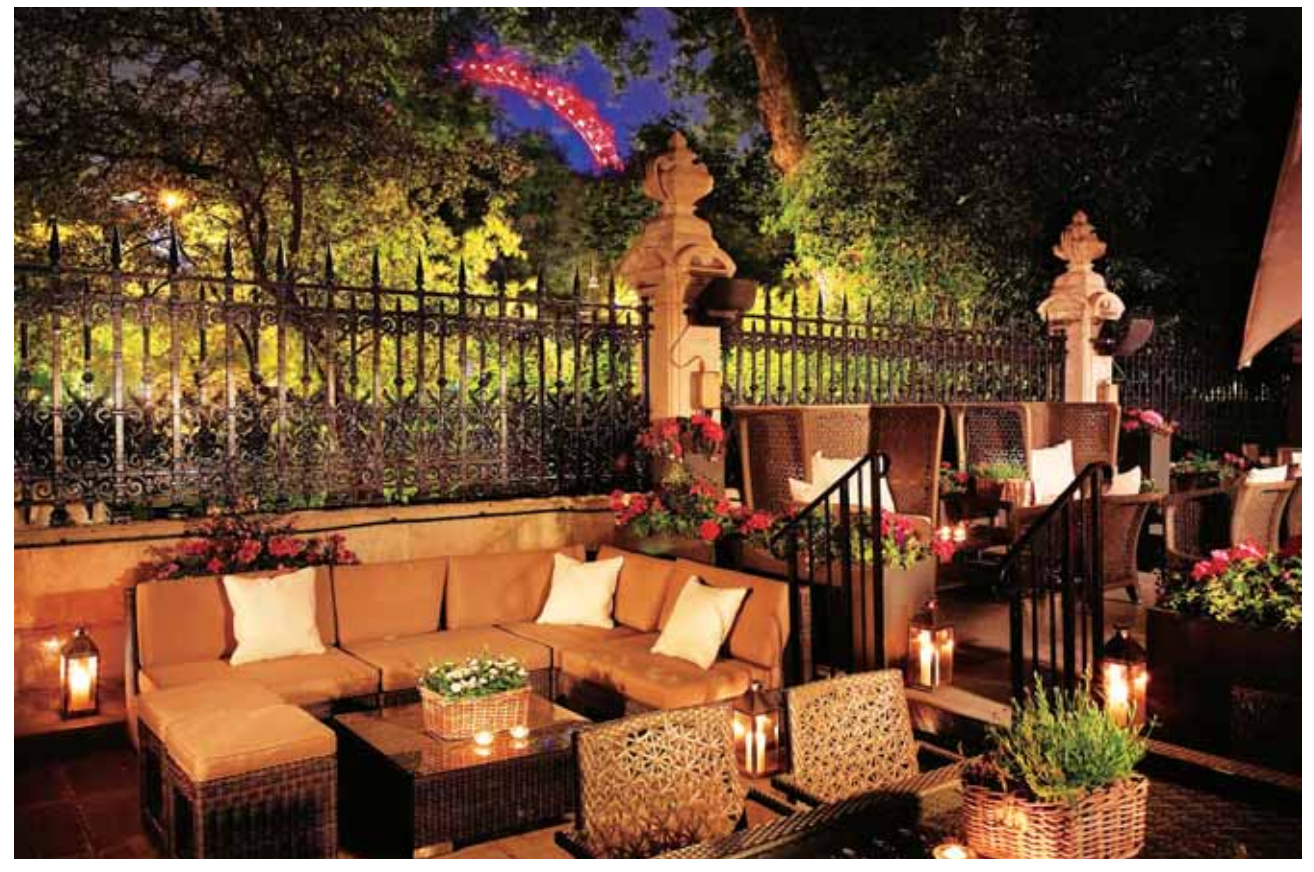
The Secret Herb Garden at the terrace of The Royal Horseguards Hotel, London

The refurbishment of The Cumberland is progressing into its final stage and the hotel is on track to be launched as the Hard Rock Hotel London in 2019. GL's total rooms available for sale will continue to be affected during this refurbishment period.