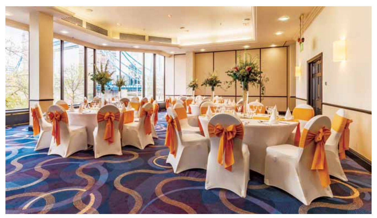
Wedding banquet at The Tower Hotel, London

The increase in administrative expenses for the year was mainly due to the strengthening of GBP against USD. The decrease in other operating expenses was mainly due to one-off expenses in the previous financial year. These were the certain assets and equipment written off due to review of hotel business strategy and the settlement of a legal claim against a subsidiary in the United Kingdom which provided a guarantee to a third party in relation to a hotel property previously leased and operated by another subsidiary.