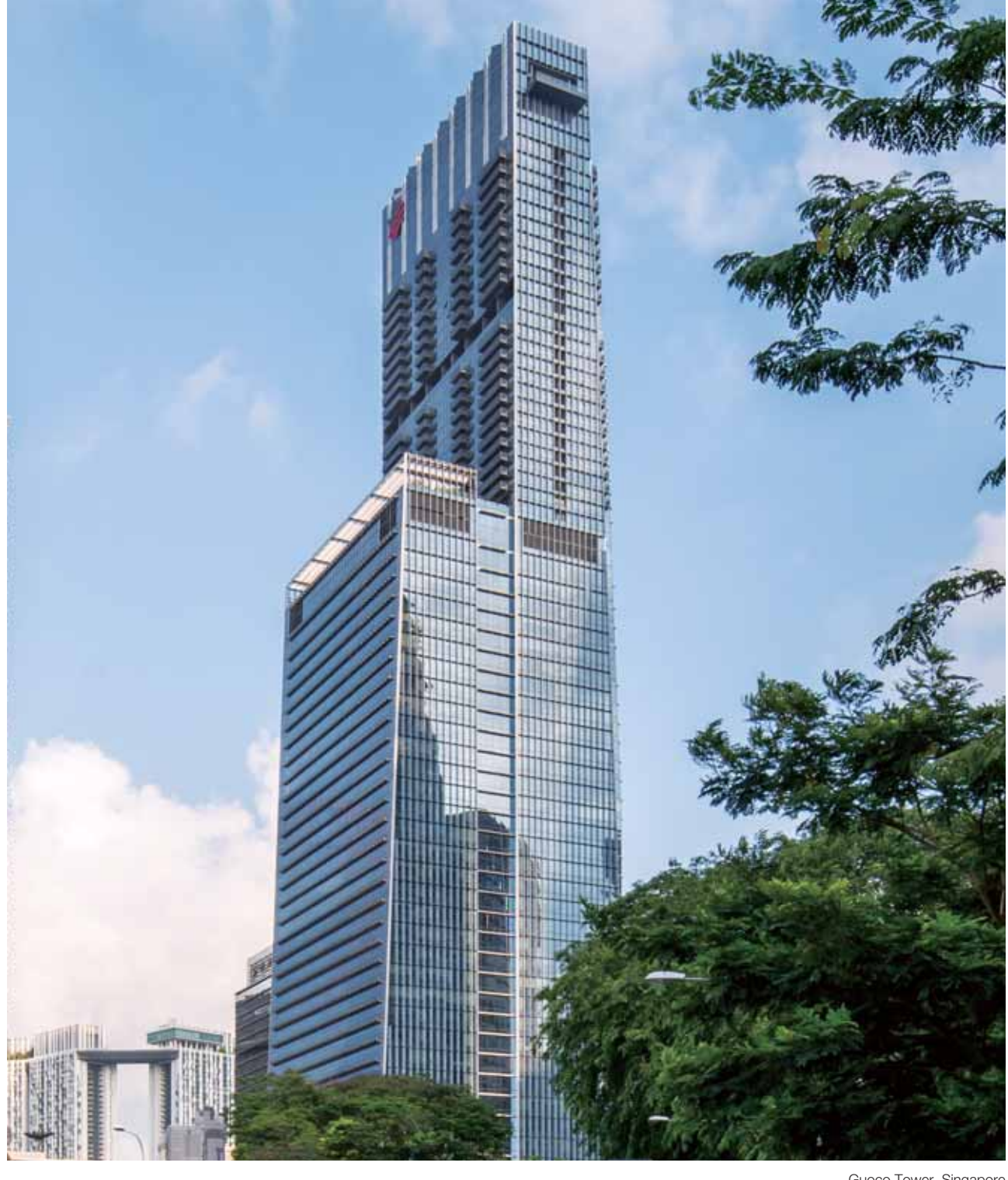
Guoco Tower, Singapore