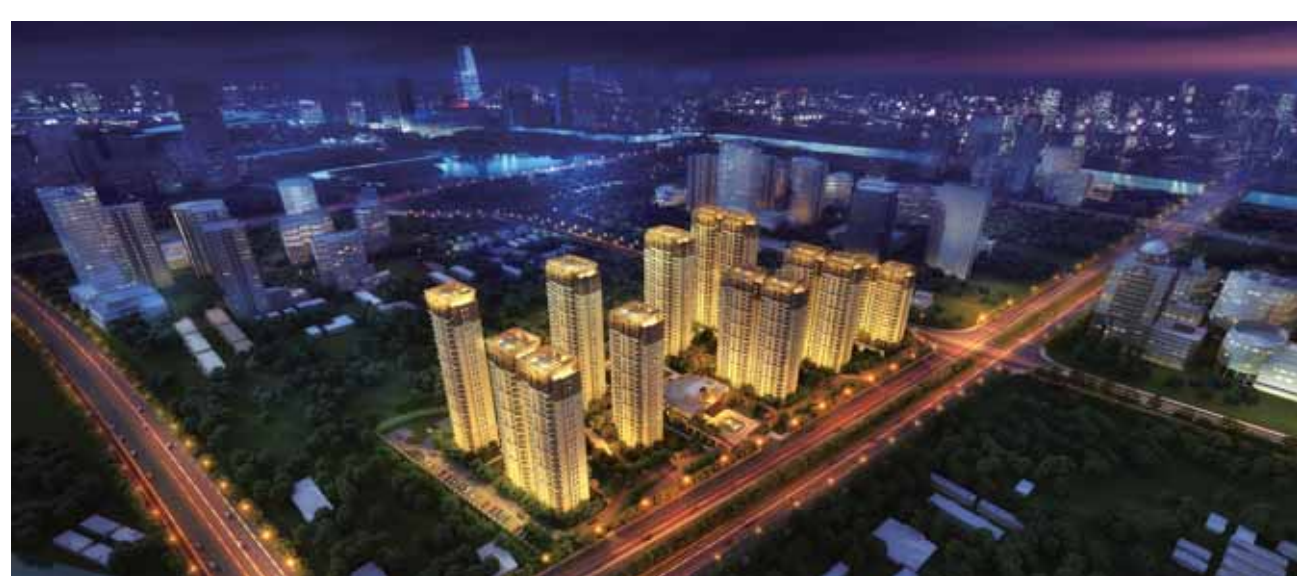
Exterior view of Changfeng Residence, Shanghai (Artist's impression)

In Malaysia, GuocoLand will continue to focus on sales and leasing of its current projects amid challenging operating conditions which are expected to continue in the near term.