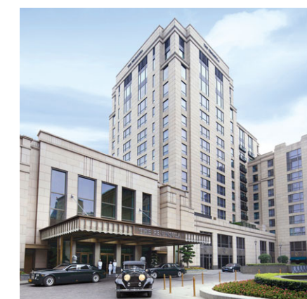
The Peninsula Shanghai Established: 2009 Rooms: 235 Ownership: 50%