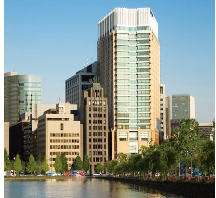
The Peninsula Tokyo Established: 2007