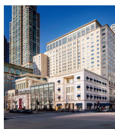
The Peninsula Chicago Established: 2001

HSH businesses are grouped under three divisions: hotels, commercial properties and clubs and services.