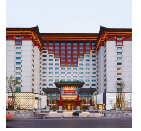
The Peninsula Beijing Established: 1989 Rooms: 230 Ownership: 76.6%