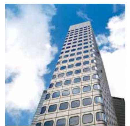
St. John's Building Hong Kong (office) Established: 1983