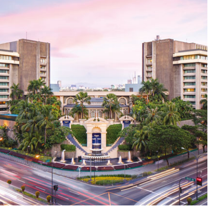
The Peninsula Manila Established: 1976 Rooms: 469 Ownership: 77.4%