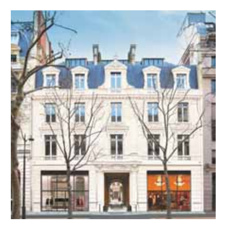
21 avenue Kléber Paris, France (office and retail) Acquired: 2013 GFA: 44,218 sq. ft. Ownership: 100%