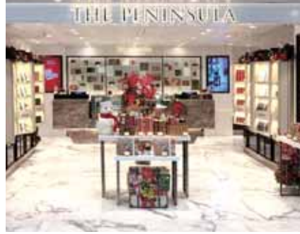
Peninsula Merchandising Established: 2003 Ownership: 100%