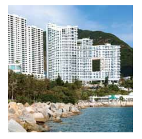
The Repulse Bay Hong Kong (residential and arcade) Established: 1976 & 1989 GFA:1,058,455 sq. ft. Ownership: 100%