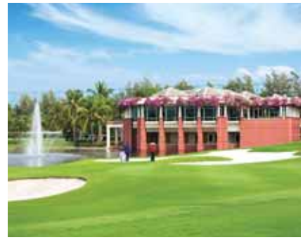
Thai Country Club Bangkok, Thailand Established: 1996 Ownership: 50%

The Peak Tram Hong Kong Established: 1888 Ownership: 100%