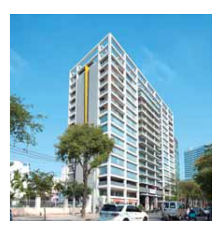
The Landmark Ho Chi Minh City, Vietnam (office and residential) Established: 1994