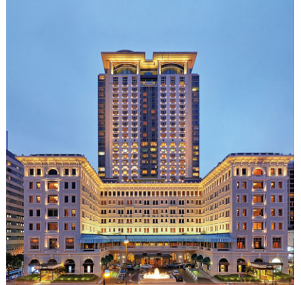
The Peninsula Hong Kong Established: 1928 Rooms: 300 Ownership: 100%