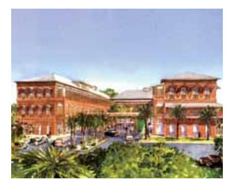
The Peninsula Yangon Ownership : 70%