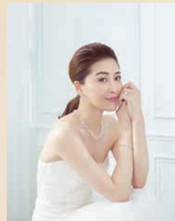
Ms. Niki Chow featuring One Vow Two Love Bridal Collection 周勵淇女士演繹 One Vow Two Love婚嫁系列

During the Year, the Group continued collaborating with pop stars of Emperor Entertainment Group and Emperor Motion Pictures, to tie-in with the launch of its new initiatives. For instance, pop star Ms. Gillian Chung, who got married last year, was invited to showcase the Chinese Wedding Fine Gold Collection and to share her joy, creating a vibrant touch for the wedding jewellery. To spotlight the new “ Yo Yo ” collection, renowned artist Mr. Nicholas Tse carried the jewellery pieces that are imbued with an urban sense of style. In October 2018, famous actress Ms. Niki Chow was appointed as the endorser for “ One Vow Two Love ” Bridal Collection, which featured a romantic story as its design motif.