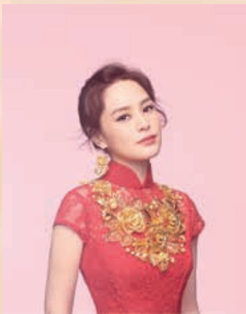
Ms. Gillian Chung featuring Chinese Wedding Fine Gold Collection 鍾欣潼女士演繹中式足金婚嫁珠寶系列

本集團憑藉與英皇集團旗下其他公司所產生的協同效應而享有獨特優勢。舉例而言，英皇集團旗下另一上市公司英皇集團(國際)有限公司擁有多項位於著名購物區之優質零售物業。本集團以公平磋商原則向其租賃該些黃金地段零售舖位，以確保客流量。另一協同效應源於與英皇集團旗下兩間私營企業英皇娛樂集團及英皇電影之合作。本集團邀請其尊尚貴賓出席電影首映禮，並贊助藝人佩戴珠寶首飾。該等由著名藝人、電影明星和城中名人參與其中的曝光機會，對提升「 英皇 」的品牌知名度甚為重要，在華語社區尤其如此。