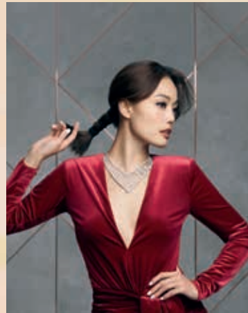
Ms. Joey Yung featuring Heartbeat Collection 容祖兒女士演繹Heartbeat心動系列