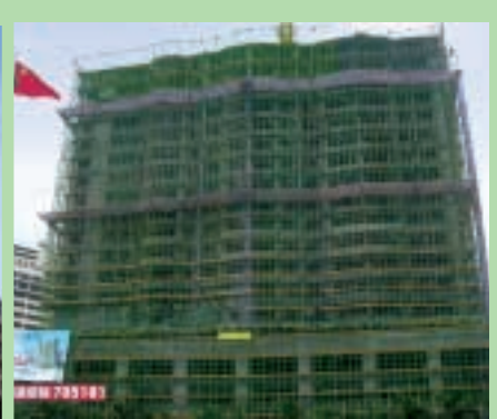
中環四季酒店-混合棚 Four Seasons <u>Hotel Central – MBMSS</u>