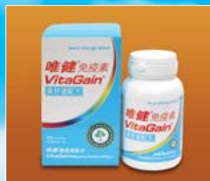
The capsule form of VitaGain™ Nasal Allergy Relief