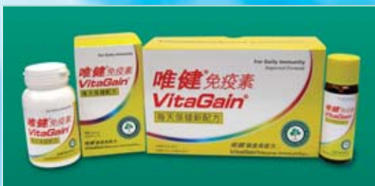
The oral liquid and capsule form of VitaGain™ For Daily Immunity

During the year, the VitaGain™ range of nutraceutical products was further extended. Several new products were introduced to the market.