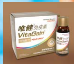
VitaGain® Immune Booster MACIMA™