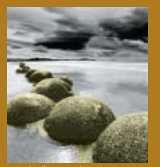
capitalise on business opportunities 商機在握