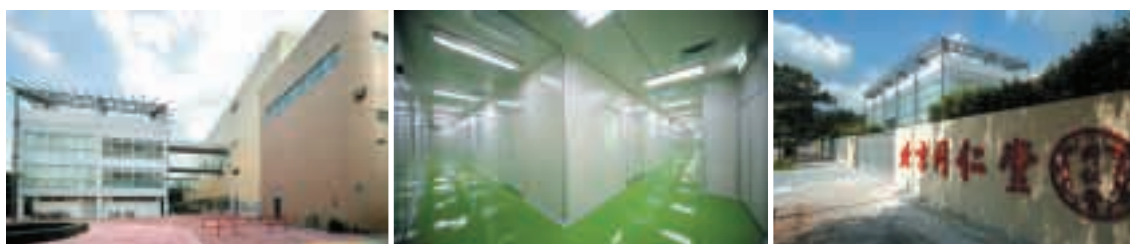
Beijing Tong Ren Tang Chinese Medicine Company Limited in Tai Po, Hong Kong

Beijing Tong Ren Tang Chinese Medicine Company Limited (北京同仁堂國藥有限公司), located at Hong Kong, was jointly invested and established by the Company and Tongrentang Ltd.. Its total investment was HK$150,000,000 under the original plan, and later was further increased by HK$28,000,000 as working capital replenishment. Of the total investment, the Company has contributed HK$90,780,000 for 51% interest, while Tongrentang Ltd. has contributed HK$87,220,000 for 49% interest. The production base of Tongrentang Chinese Medicine in Tai Po Industrial Estate has been fully completed by the end of 2006, and will be put into trial production in the first half of 2007. Such production base, upon completed, will focus on producing products for overseas markets so as to flourish sales of overseas markets.