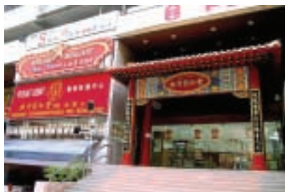
the drug store in Malaysia

Currently, the Company's six joint ventures in Hebei, Henan, Hubei, Zhejiang, Anhui, Jilin respectively are capable of providing the Company with major Chinese medicinal raw materials such as cornel (山茱萸),