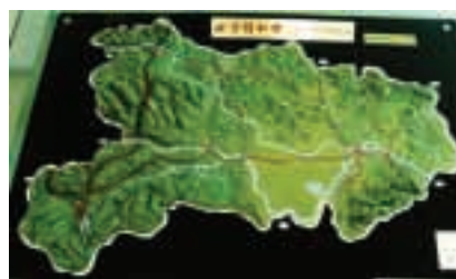
Map of plantation fields of Beijing Tong Ren Tang Hubei Chinese Medicinal Raw Materials Co., Limited

tuckahoe (茯苓), catnip (荆芥) and isatis root. In 2006, Other than producing, collecting and processing medicinal materials, some production bases cooperated with research institutions and achieved fruitful breakthroughs in the research of Chinese herbs production techniques. The “tuckahoc inducement growing” (茯苓诱引栽培) technique invented by the Hubei production base has been authenticated and examined. Basing on the state’s GAP (Good Agriculture practice), each production base established their technical standards accordingly to further improve their quality control systems so as to fully guarantee the quality of raw materials. In 2006, the Company’s production bases of Chinese medicinal raw materials achieved sales income of RMB15,880,000. The production bases of Chinese medicinal raw materials played an important part in securing supply and quality of Chinese medicinal raw materials required for the production of the Company’s products.