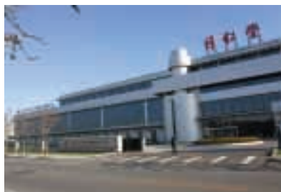
Yi Zhuang production base in Beijing

Beijing Tong Ren Tang Tongke Pharmaceutical Company Limited (北京同仁堂通科藥業有限責任公司) is located at Tongzhou district of Beijing City. Given the completion of all construction works of the Chinese medicine raw materials preprocessing workshop and plant and the completion of the installation, adjustment and trial runs of equipment, production operation will commence in 2007. The workshop will produce semi-finished goods for different forms of medicine of the Company, further enhancing the overall productivity of the Company.