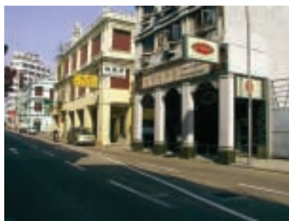
the drug store in Macau