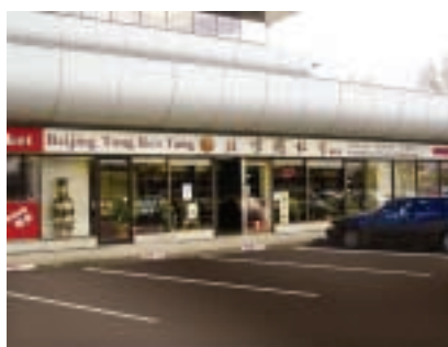
the drug store in Canada