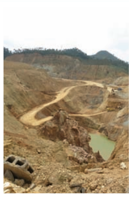
Field visit in Yunnan 雲南實地考察