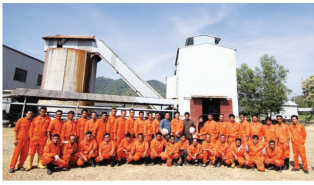
Local operating team in Indonesia managed by Dragon Group Dragon集團管理的印尼當地團隊