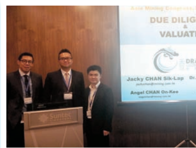
Asia Mining Congress 2014