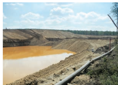
Placer gold project in Siberia 西伯利亞的砂金礦項目