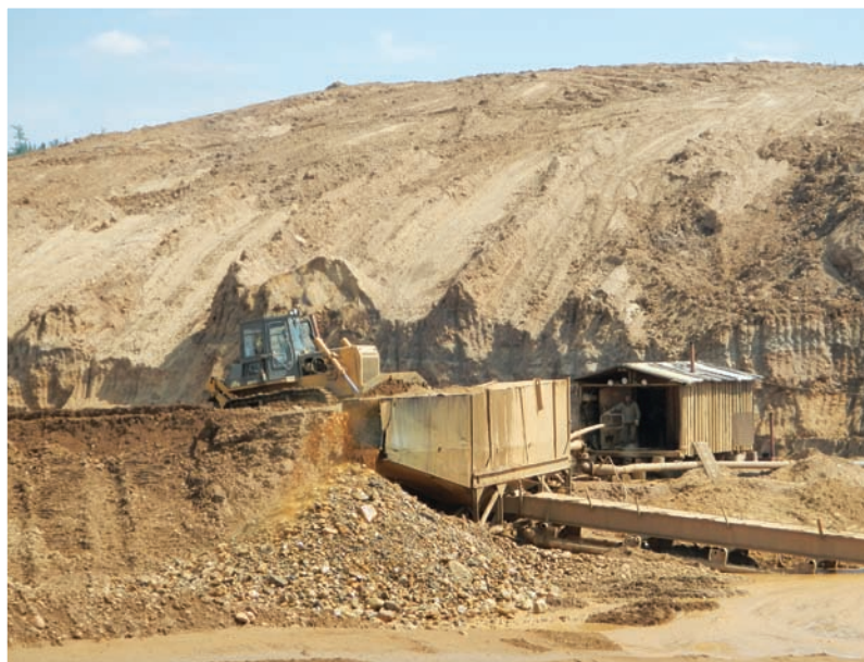
Field visit in Siberia 西伯利亞實地考察