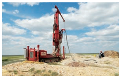
Drilling work in Kazakhstan 哈薩克斯坦的鑽探工作