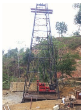
Drilling work in Indonesia 印尼鑽探工作

Dragon Group has been working in Indonesia since 2012 and Dragon's professional team has profound experience in exploration work in the Philippines, Cambodia and other countries in the region. Dragon Group has been engaged in laboratory operation, processing plant management, public relationship management and drilling services mainly to a copper-gold polymetallic project ("Copper-Gold Project") in this region. However, this project has been affected by some incidents such as shortage of water supply due to adverse drought season in the second quarter of 2014 and local community's concerns on the drilling activities in the first quarter of 2015 that led to postponement of the drilling work. Although the concerns have been addressed and conversations with the local community are in progress, the project owner is considering re-allocating the capital and human resources from conducting exploration to resuming production in an area whose local community supports the mining activities. Dragon Group thus is expected to serve as a mining consultant by providing mining recommendations and to assist in logistics and preparation work for the production activities in the second half of 2015. During the year, Dragon's business in Southeast Asia contributed around 30% or approximately HK$15,072,000 to its full year revenue and 12% or approximately HK$4,314,000 to its post-acquisition revenue.