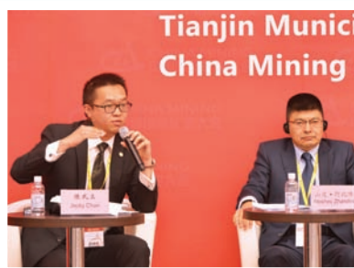
China Mining Conference 2014 中國礦業大會 2014