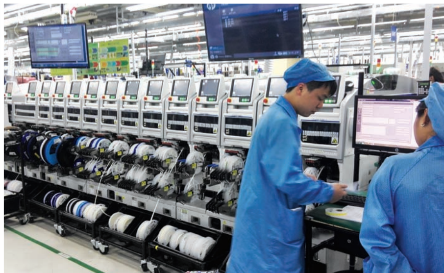
Fuji NXT Machine photo at our customers factory 富士 NXT 設備在客戶工廠照片