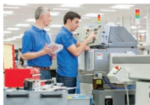
Machine production at customer site 於客戶工廠之生產設備