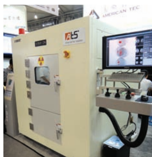
ATS X-Ray in Nepcon Shanghai Exhibition 2013