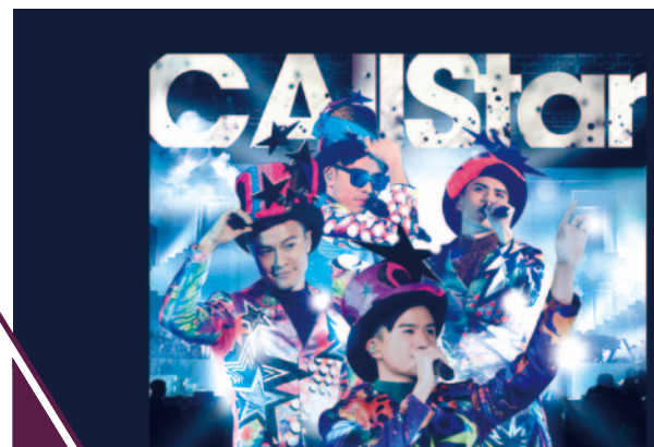
CAIStar 我們的胡士托演唱會 LIVE 2 CD

The Group is an equal opportunity employer and does not discriminate on the basis of personal characteristics. The Group has employee handbooks outlining terms and conditions of employment, expectations for employees’ conduct and behavior, employees’ rights and benefits. We establish and implement policies that promote a harmonious and respectful workplace.