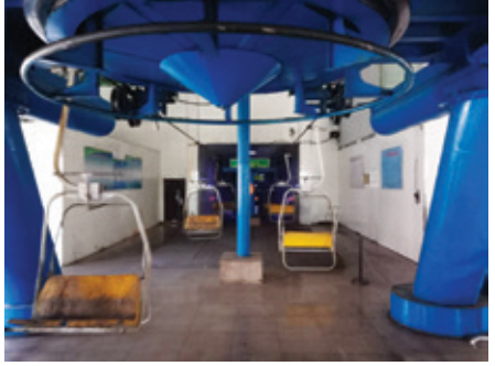
"Overhead Manned Cableway Device" manufactured by Kaiyuan

Positive news is that coal prices in china has been relatively stable during the Period, after a spike in prices during the second half of last year.