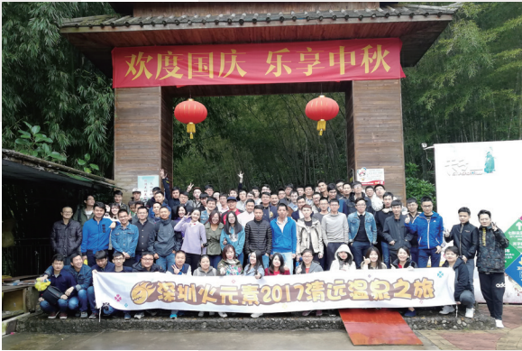
2017 Group Picnic