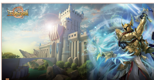
Kings & Legends (王者召唤)