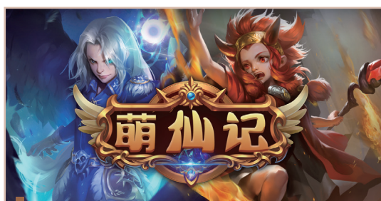
Legend of Fairies (萌仙记)