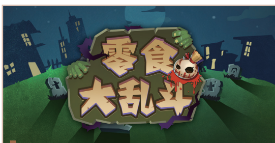
Sweeties Fighting (零食大乱斗)

As a game developer based in Shenzhen, the PRC, we are principally engaged in the development of browser and mobile games to players around the world. To boost the marketability of our self-developed browser and mobile games in different regions and enhance the players' gaming experience, we have launched different language versions for our games, including English, Japanese, French, German, Simplified Chinese and Traditional Chinese. In addition, to focus our resources on the development of browser and mobile games, we have licensed our games to various game operators with the exclusive and/or non-exclusive right to operate, publish and distribute specific games within an agreed period and designated territories. During the Reporting Period, our popular browser and mobile games included: