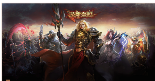
Hero's Crown (英雄皇冠)