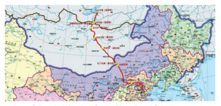
Railway logistics along Russia, Mongolia and China