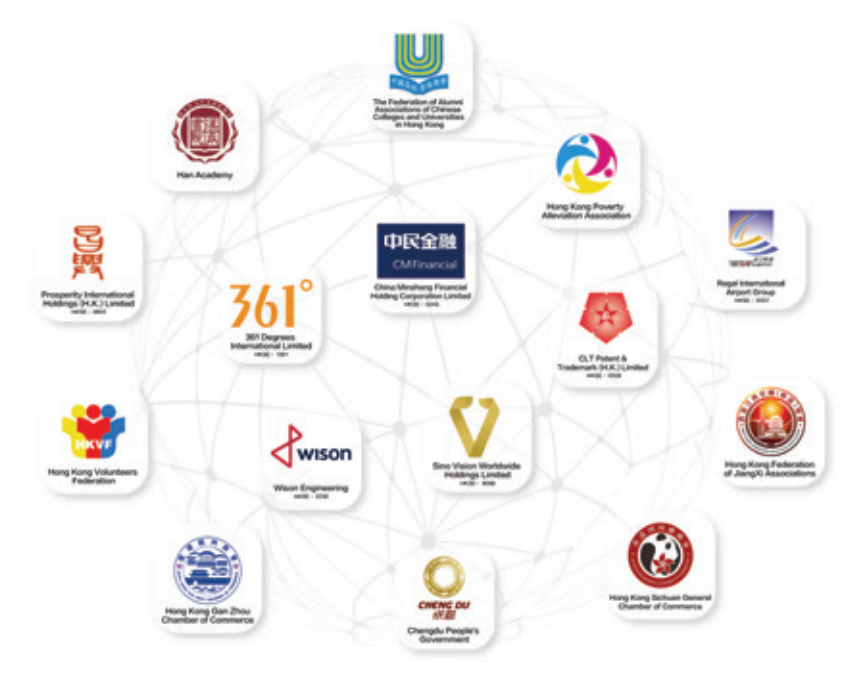
▲ Existing Clients of PCCC

We are able to garner more information and opportunities by maintaining traditional investment attraction projects with listed company consulting businesses, while also networking extensively with associations and non-profit organizations in Hong Kong.