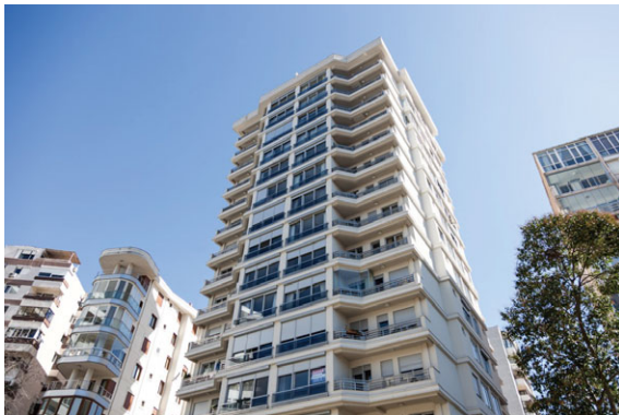
Doğa Apartment, Kadikoy, Istanbul, Turkey 土耳其伊斯坦布爾卡德柯伊Doğa Apartment