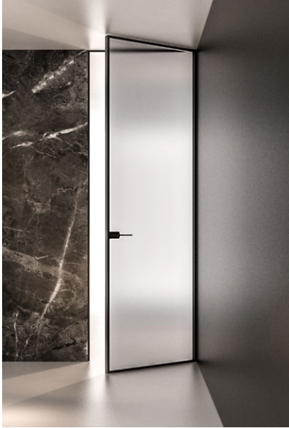
Customized design door 量身訂製門