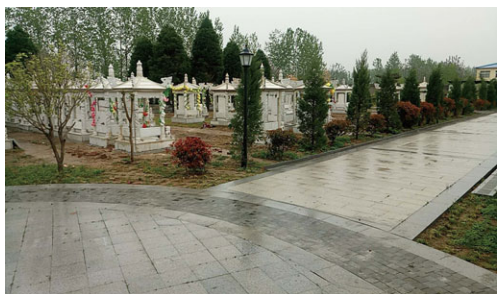
Xianganling Cemetery is situated on the land with an area of approximately 47 Mu which is located at Zhecheng County, Henan Province, the PRC. 襄安陵公墓位於中國河南省柘城縣，土地面積約47畝。

Due to the complexity of local government regulation, the sales process of the cemetery business in Henan, PRC has been affected during the Year. Taking into account of the growth prospect and the restricted environment in PRC, the Group maintains provision for impairment of receivables and for estimated losses that result from the inability of the cemetery to maintain normal operation. The Group will strive to negotiate with the local government in order to creating a favourable environment for the cemetery business in Henan.