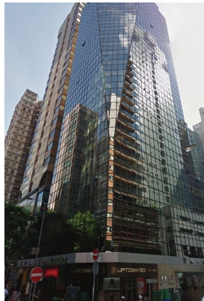
Located in the central business district in Wan Chai, Hong Kong