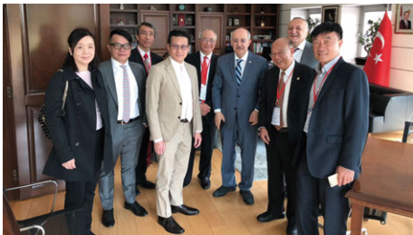
Delegates from Turkey Delegation meet the Principal of Istanbul Technical University

To further explore the opportunities in Turkey, we have participated the ““Hong Kong’s Role in the Belt and Road Strategic Development Plan of the Motherland” Seminar” and “Turkey Economic and Cultural Exchange Delegation Trip” organised by Chinese-Turkish Economic and Cultural Exchange Association (“CTECEA”) during the year. The association is formed by a body of professionals, with an aim to promote business and cultural links between Turkey, mainland China and Hong Kong, in order to contributing to the long-term interests and sustainable development between the countries.