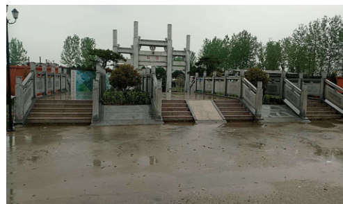
Evershine Group offers premium and professional services in cemetery. 永耀集團於公墓提供優質及專業之服務。

年內，由於當地政府監管規例相當複雜，故於中國河南省展開之公墓業務銷售工作一直受到影響。考慮到中國之增長前景及環境限制，本集團就公墓無法維持正常營運導致應收款項減值及估計虧損作出撥備。本集團將努力與當地政府磋商，為位於河南之公墓業務締造良好的環境。