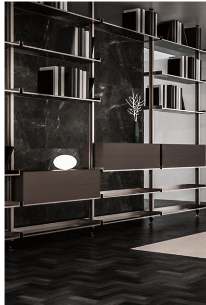
Customized design bookshelf 量身訂製書架