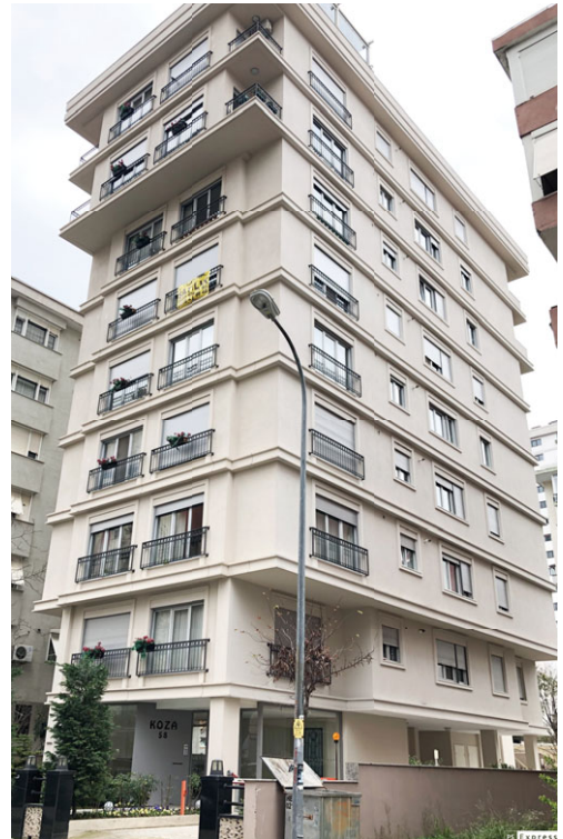
Koza Apartment, Kadikoy, Istanbul, Turkey 土耳其伊斯坦布爾卡德柯伊Koza Apartment