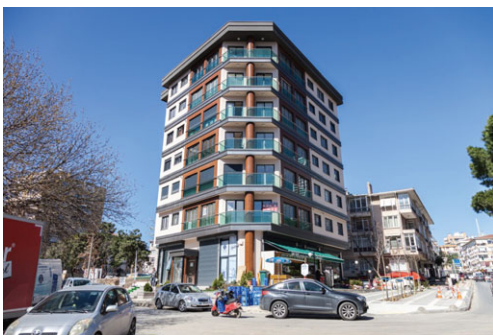
Akasya Apartment, Kadikoy, Istanbul, Turkey 土耳其伊斯坦布爾卡德柯伊Akasya Apartment

Strategically, 2018 has been a significant year for Evershine, in which the Company has continued developing business opportunities in property development in the Republic of Turkey (“Turkey”). Despite the fact that the subdued economic environment is continuing to negatively impact our financial result, the Group has been continuing to explore further investments opportunities to develop our business. The Group has been continuing to build, grow and unlock the value behind our businesses and investments. We believe our strategy is working on the right track despite the challenging market conditions.