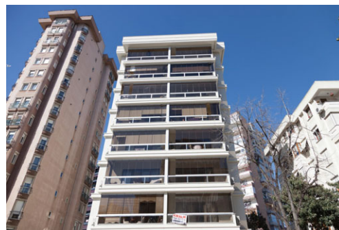
Evim Apartment, Kadikoy, Istanbul, Turkey 土耳其伊斯坦布爾卡德柯伊Evim Apartment

二零一八年對永耀而言意義重大，本公司於年內繼續在土耳其共和國（「土耳其」）發掘物業開發商機。儘管經濟不景氣持續對我們之財務業績造成負面影響，惟本集團一直不斷發掘更多投資機遇以發展業務。本集團繼續建設、發展及發揮業務及投資蘊含之價值。雖然市況充滿挑戰，惟我們相信我們之策略正朝著正確方向推進。