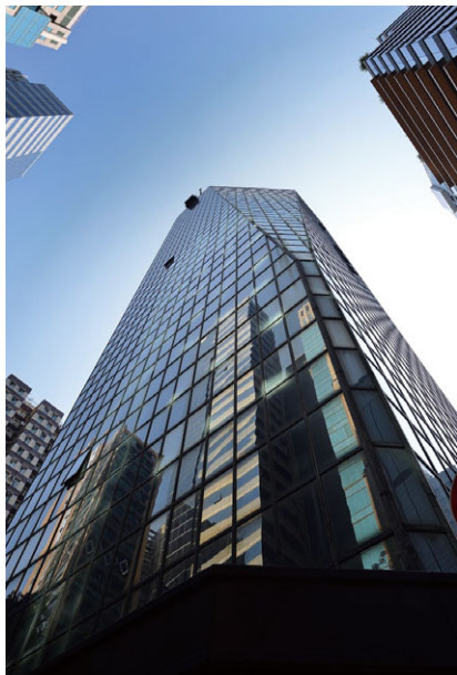
Henan Building, Wan Chai, Hong Kong