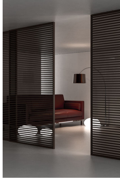
Customized design door 量身訂製門