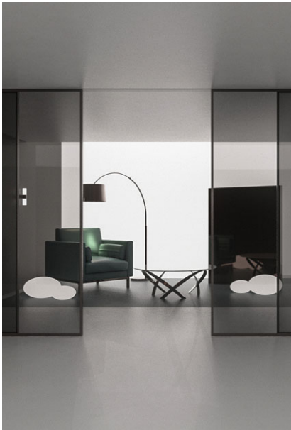
Customized design door and window frames 量身訂製門及窗框