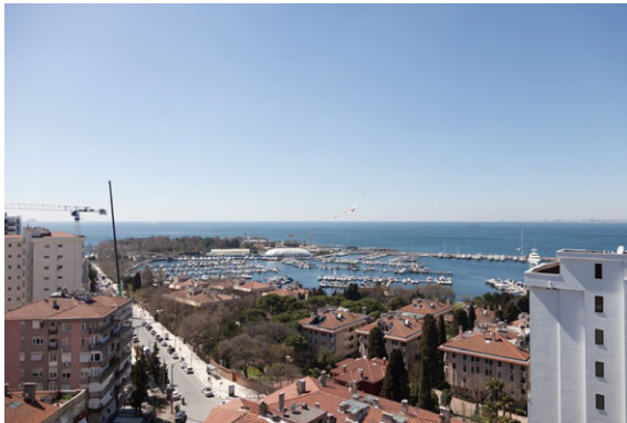
Sea view from Doğa Apartment, Kadikoy, Istanbul, Turkey 土耳其伊斯坦布爾卡德柯伊Doğa Apartment對出海景

年內，本集團在「一帶一路」倡議之支持下發掘更多機遇，並擴大於土耳其之物業投資規模。本集團已完成收購Boyracı Construction額外30%股權，Boyracı Yapı İnşaat ve Taahhüt Gayrimenkul Yatırım Anonim Şirketi(「Boyracı Construction」)是於土耳其經營房地產開發之公司。收購後，Boyracı Construction成為本集團間接擁有60%權益之附屬公司。Boyracı Construction已完成5個項目，包括14個住宅單位及2個商業單位，另外兩個項目預計將於二零一九年竣工。大多數單位向租戶出租，故已產生穩定租金收入。我們預計該等租金收入將於二零一九年保持穩定。由於土耳其政府於二零一八年降低外國人獲得土耳其公民身份的資格，故土耳其之外國物業買家總數呈上升趨勢。本集團相信此趨勢將持續上升，並為我們目前空置之物業單位及在建單位提供良機，可於二零一九年帶來可觀收益。