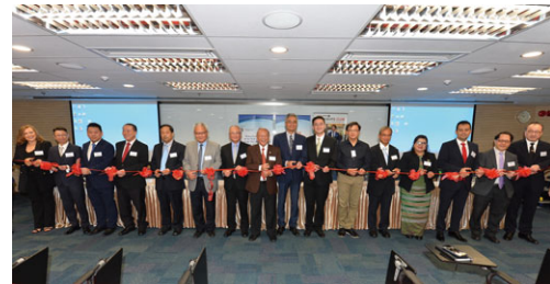
Launching Ceremony of “Hong Kong’s Role in the Belt and Road Strategic Development Plan of the Motherland” Seminar

為了進一步發掘土耳其之機遇，於年內，我們參加了由中土經濟及文化交流協會（「中土交流協會」）舉辦之「『香港在祖國一帶一路戰略發展計劃中的角色』研討會（“Hong Kong’s Role in the Belt and Road Strategic Development Plan of the Motherland” Seminar）」及「土耳其經濟及文化交流代表團（Turkey Economic and Cultural Exchange Delegation Trip）」。 該協會由一眾專業人士成立，目的為促進土耳其、中國內地與香港間之商業及文化聯繫，為三地之長遠利益及可持續發展作出貢獻。