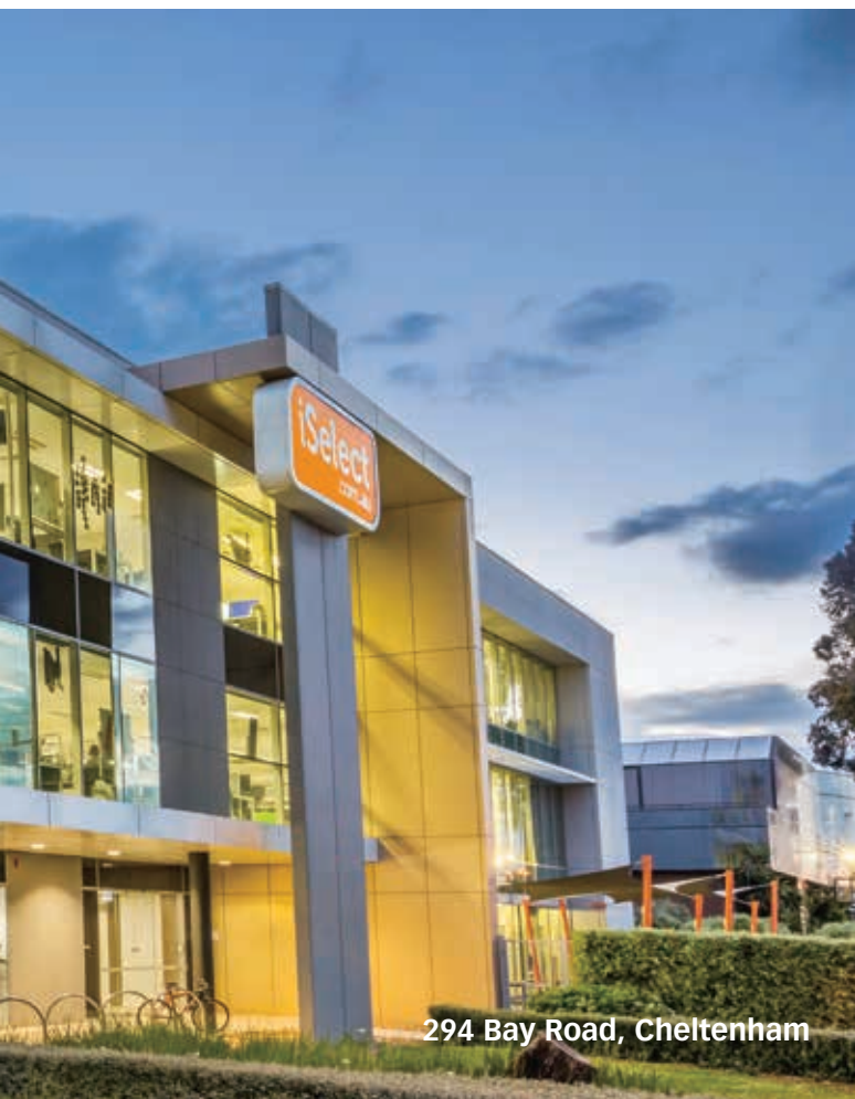
294 Bay Road, Cheltenham

The Group's Management Discussion and Analysis is divided into the following sections: