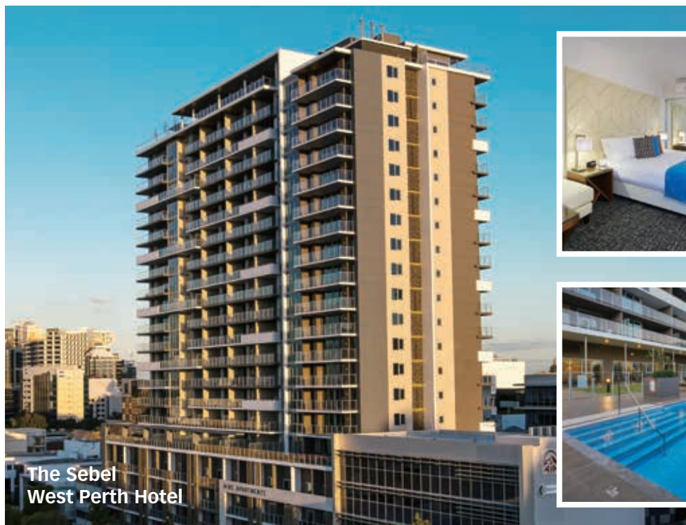
The Sebel West Perth Hotel