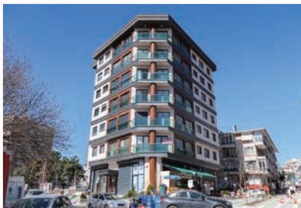
Akasya Apartment, Kadikoy, Istanbul, Turkey 土耳其伊斯坦堡卡德柯伊Akasya Apartment

二零一九年對永耀而言雖然重要，但此為起伏不定之一年。香港爆發社會運動加上二零一九年年底出現新型冠狀病毒肺炎，使我們為確保業務盡可能順利進行而面對很大挑戰。儘管面對上述不可預知之事件，以及受到香港和土耳其共和國（「土耳其」）兩地經濟環境疲弱所負面影響，惟本集團不斷發展，致力提升集團業務及投資之表現及價值。