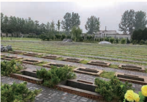
Our services include the sales of niches and plots, thus offering our expertise in tomb design and construction services, cemetery and columbarium maintenance services 我們的服務包括龕位及墓地銷售，連帶提供我們在墓穴設計及建設服務、公墓及骨灰龕維護服務方面之專業知識