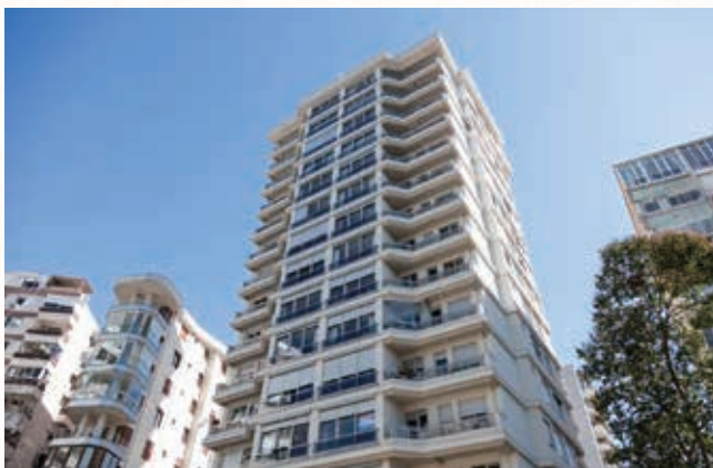
Doğa Apartment, Kadikoy, Istanbul, Turkey 土耳其伊斯坦堡卡德柯伊Doğa Apartment