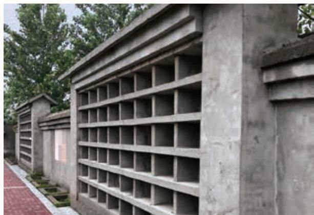
We provide 12,000 units of cemetery 我們提供12,000個公墓龕位