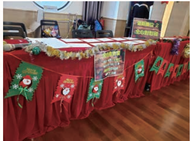
Evershine volunteer team designed and hosted a game booth for parents and younger participants. More than 100 children and their parents enjoyed the game booth exceedingly 永耀義工團體為參與活動之家長及小朋友設計並主持一個攤位遊戲。超過100名兒童及家長樂在其中

年內，永耀參加了由聖公會聖匠堂社區中心（「社區中心」）舉辦之聖誕節義工活動，活動目的是服務九龍城區基層家庭，透過活動凝聚九龍城之基層家庭及小朋友，讓他們感受到節日氣氛及社區人士之關愛。另外透過捐款，並由社區中心協助選購物品，如家品、文具、玩具及書籍等，送贈區內有需要人士，以支持及紓緩基層家庭部分經濟壓力。