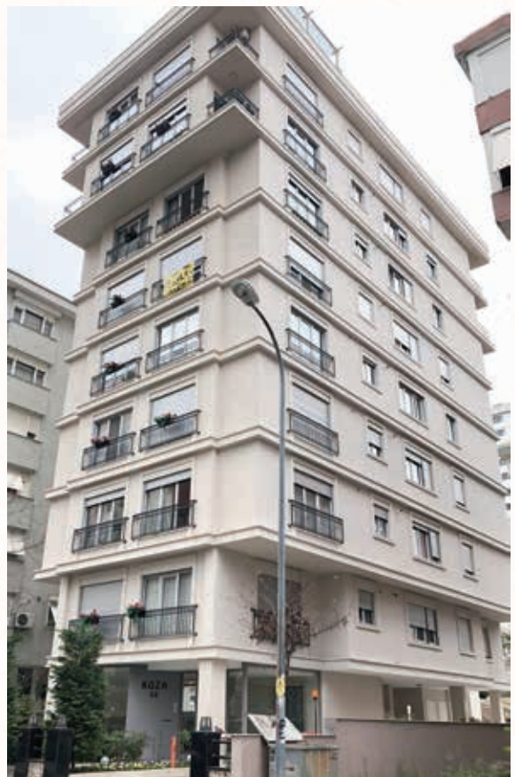
Koza Apartment, Kadikoy, Istanbul, Turkey 土耳其伊斯坦堡卡德柯伊Koza Apartment