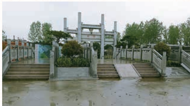
Evershine Group offers premium and professional services in cemetery 永耀集團於公墓提供優質及專業之服務