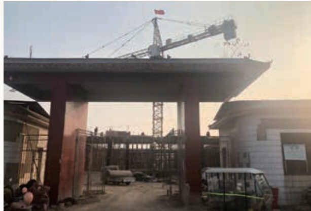
Funeral Parlor estimated to reach completion by the end of 2020 殯儀館預計於二零二零年年底落成