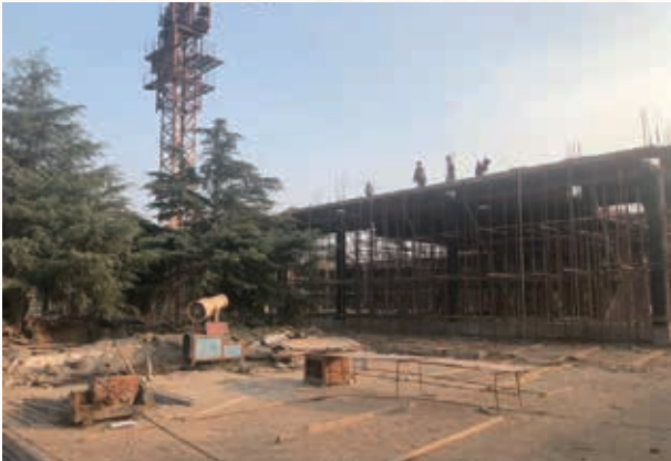
Funeral Parlor under construction 興建中之殯儀館