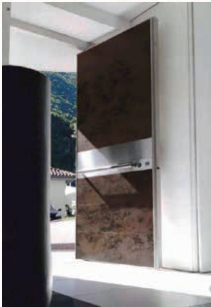
Customized design door 量身訂製的門