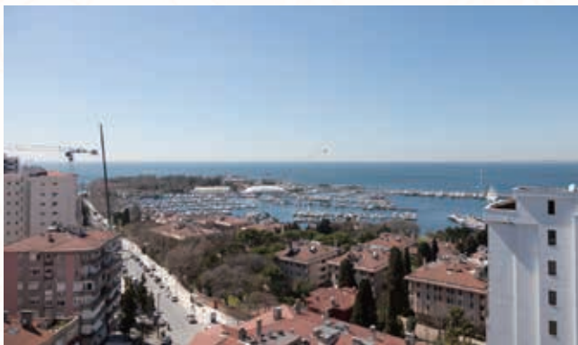
Sea view from Doğa Apartment, Kadikoy, Istanbul, Turkey 土耳其伊斯坦堡卡德柯伊Doğa Apartment對出海景

年內，本集團繼續透過本集團間接持有60%之附屬公司Boyracı Yapı İnşaat ve Taahhüt Gayrimenkul Yatırım Anonim Şirketi (「Boyracı Construction」)來推進其在土耳其物業發展領域之發展步伐。Boyracı Construction是於土耳其經營房地產開發及城市改造項目之公司，其已完成5個項目，包括由14個住宅單位及2個商業單位組成之報價物業。於二零一九年十二月三十一日，兩個項目預計將於二零二零年年中竣工，其將額外為我們的物業組合帶來8個住宅單位及3個商業單位。截至本報告日期，其中一項名為İcaliye項目之在建物業已於二零二零年五月竣工，並已取得相關業權。大部分單位經已出租並一直貢獻穩定的租金收入，預期於二零二零年該筆租金收入將維持穩定。受惠土耳其政府制定政策降低外國人投資物業移民之要求，Boyracı Construction於二零一九年成功售出部分物業，而未來數年之銷售數字預期將逐步增加。