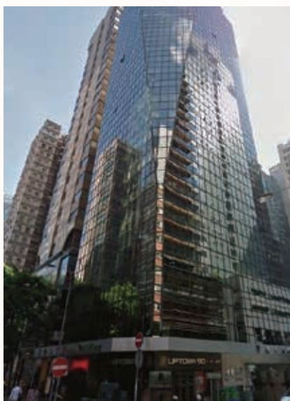
Located in the central business district in Wan Chai, Hong Kong 座落於香港灣仔之商業中心區

The Group has set up a new indirect non-wholly owned subsidiary, incorporated in the People's Republic of China ("PRC"), specializing in furniture design including window frames, doors and wardrobes customized design and manufacture. The products have combined the values and technological efficiencies with fine and unrivalled craftsmanship. The business will target high-end customers as well as corporate customers such as hotels and property developers in PRC's first-tier cities, by providing personalized and unique furniture in high quality. However, the coronavirus epidemic in major cities in China have put the business behind original schedule, and the sales work has been postponed. Once the coronavirus is under controlled, we believe that the growing urbanization and commercialization trend in PRC will lead to a high demand for advanced and reliable customized design furniture. Positive construction spending and ongoing renovation are the key trends witnessed which would gradually favor viable growth opportunities for the market.