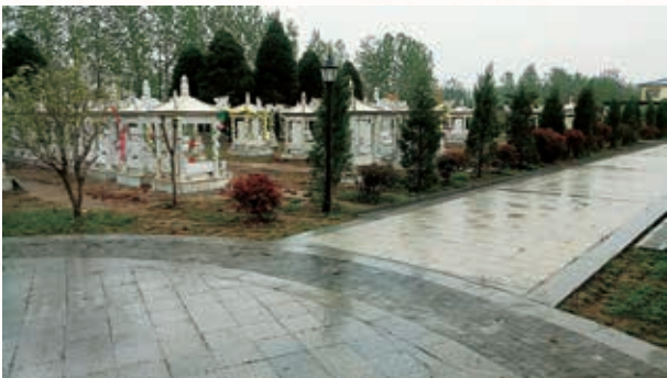
Xianganling Cemetery is situated on the land with an area of approximately 47 Mu which is located at Zhecheng County, Henan Province, the PRC 襄安陵公墓位於中國河南省柘城縣，土地面積約47畝