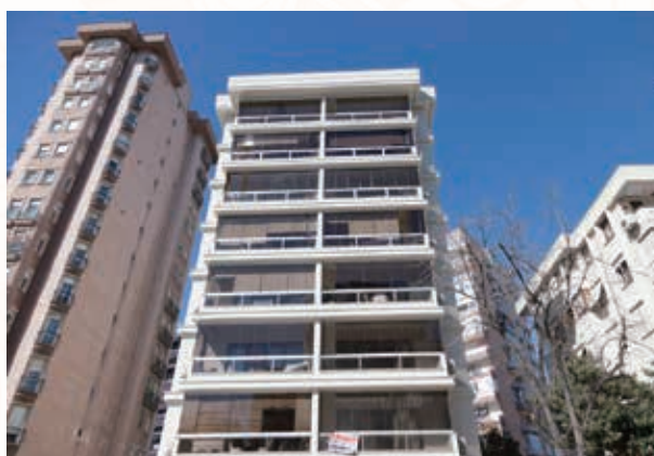
Evim Apartment, Kadikoy, Istanbul, Turkey 土耳其伊斯坦堡卡德柯伊Evim Apartment