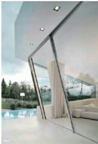
Customized design window frames 量身訂製的窗框

Our money lending business wholly owned subsidiary company Ottoman Evershine Finance Limited, has been continued to operate during the year and provided the Company with stable income.