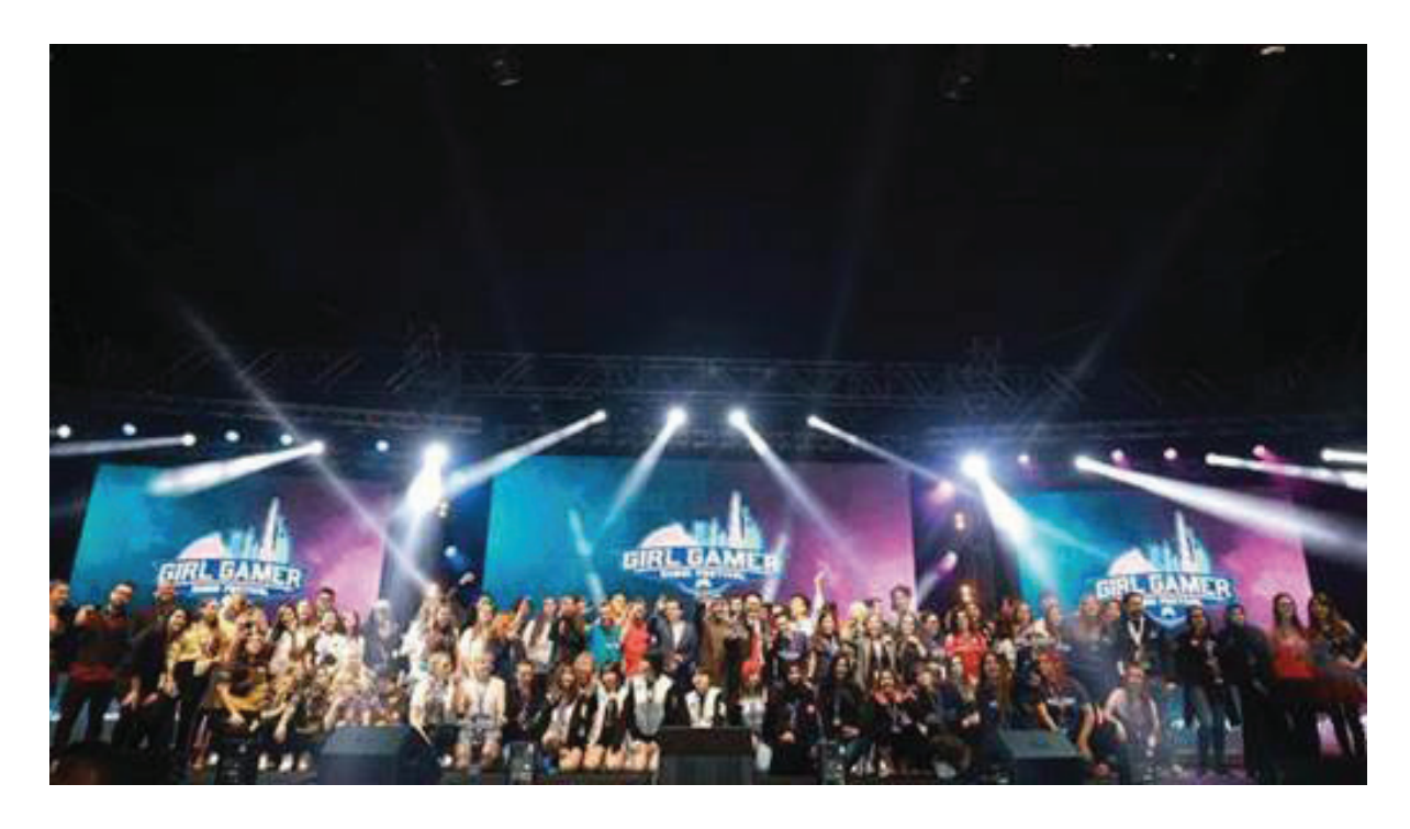
GIRLGAMER World Finals in Dubai, UAE