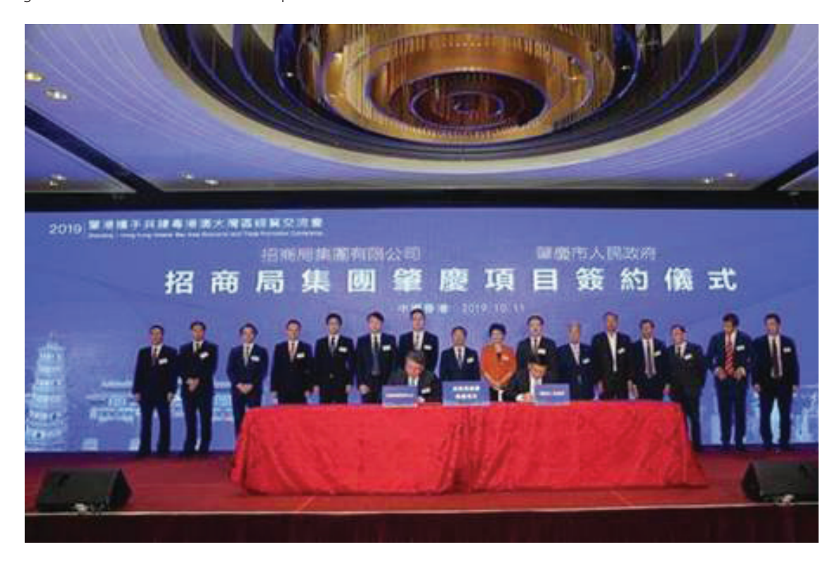
2019 Zhaoqing — Hong Kong Greater Bay Area Economic and Trade Promotion Conference

To cope with changes in the market, in 2020, PCCC will introduce new services and approaches, such as by increasing the portion of online services to offset the consequences of coronavirus to the offline events, while focusing on domestic and international promotional events.