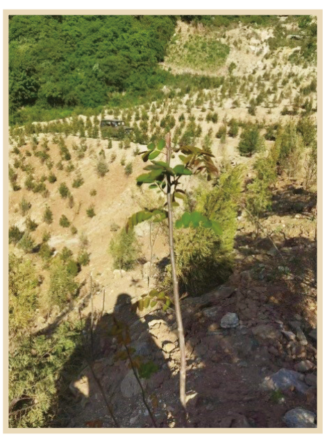
In the year 2023, Taizhou Mining actively planted saplings in the nearby mountain areas, including locust trees, poplar trees, oil pine trees, Pinus armandii and cypress trees, which are suitable for planting in the Qinling region. 於二零二三年度,太洲礦業積極在附近山區栽種樹苗,主要品種包括槐樹、楊樹、油松樹、 華山松樹及柏樹等適合在秦嶺山區種植的樹苗。

Scope 1: represents diesel and gasoline consumed by motor vehicles.