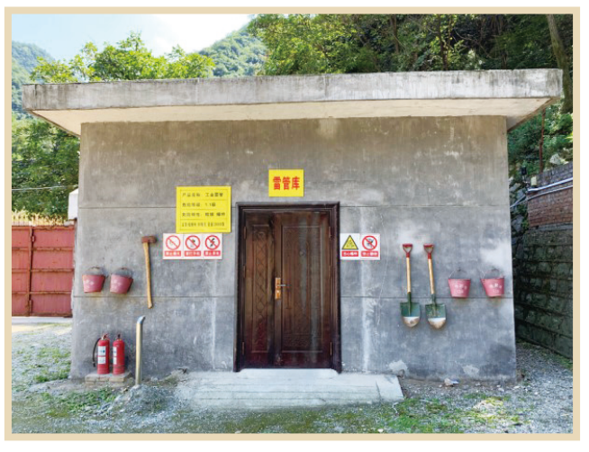
Safety facility outside explosive storage 雷管庫外的安全設備