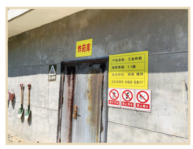
Safety facility outside warehouse storing detonators 炸藥庫外的安全設備

貴集團使用炸藥開採金礦物,並嚴格遵 守與中國標準貫徹一致的炸藥使用規則 及法規。 貴集團設有經安全機構及控 制物資的地方公安機關批准並根據其規 定標準設計的專門、專用及隔離的炸藥 庫。雷管及炸藥存放於兩個獨立的庫 內,彼此之間存有安全距離。該等庫房 所在的院落完全被高牆、金屬門及24 小時監控攝像頭護衛。兩間炸藥庫均各 有兩把鎖、鎖匙由兩名獨立僱員(一名 管理人員及一名安全人員)保管。僅於 該兩名人員(鎖匙保管人)同時出現方能 完全打開全部門鎖,方可取得雷管及/ 或炸藥。存儲設施由管理層以及安全及 公安機關定期檢查,以確保始終合規。 使用炸藥後, 貴集團將使用檢測設備 測量空氣殘餘物數量,待空氣符合標準 後方會安排僱員進入金礦。