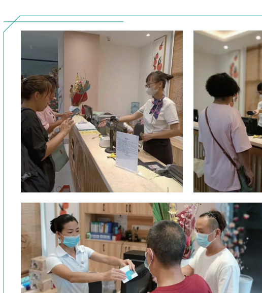
Front Desk Receptionist Competition

During the Period, the Group has organised a variety of activities to motivate and to enhance overall morale of its employees, the Group also organises company events such as Occupational Skills Competition, Fire Safety Skills Competition, Lifesaving Competition, Employees Award Ceremony, etc. to allow the staff members to gather outside of work for bonding and team-building.