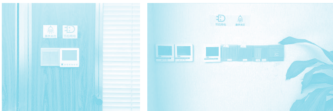
Signs for reminding employees to save energy