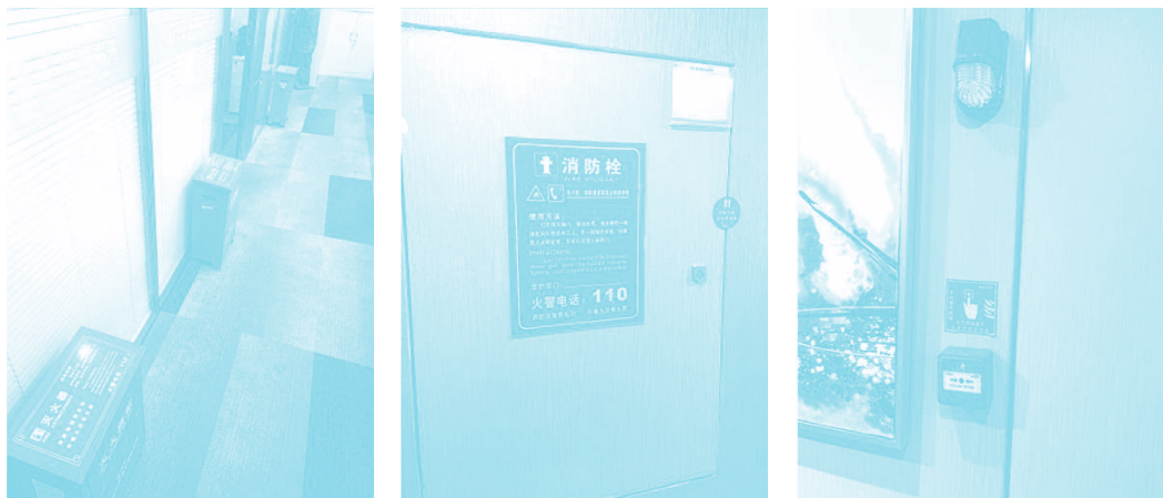
Fire safety equipment in the workplace

The Group is not aware of any material non-compliance with the Work Safety Law of the PRC, Regulations on Work-Related Injury Insurance of the PRC and other applicable laws and regulations that has a significant impact on the Group relating to provide a safety working environment and protecting employees from occupational hazards during the Reporting Period.