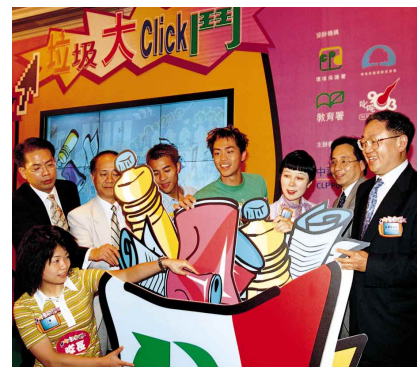
"Place the Waste On-line Challenge" award ceremony

The good safety performance in 2000 was overshadowed by a tragic accident at a 132/11kV sub-station in Kowloon in January 2001, which led to the loss of life of two CLP Power employees. This accident has been the subject of a wide-ranging and thorough enquiry by a high-level CLP management panel. The conclusions of the investigation have been disclosed to the relevant