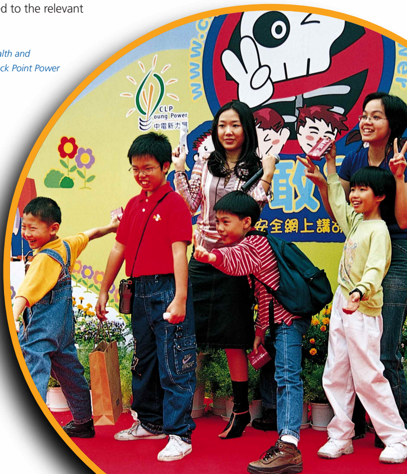
CLP Power's Safety, Health and Environment Day at Black Point Power Station

authorities. Everything possible will be done to ensure that this never happens again. CLP has made massive efforts to promote safety in all areas of its operations. This accident was a stark reminder of the need for constant vigilance and attention to safety as we carry on our business, day after day. We are committed to continuous improvement in our safety performance and a constant drive to zero accident levels across our business.