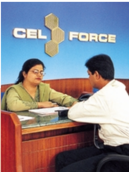
The Group's operation in Gujarat, under the brand name CelForce, is the largest non-metro mobile operation in India.