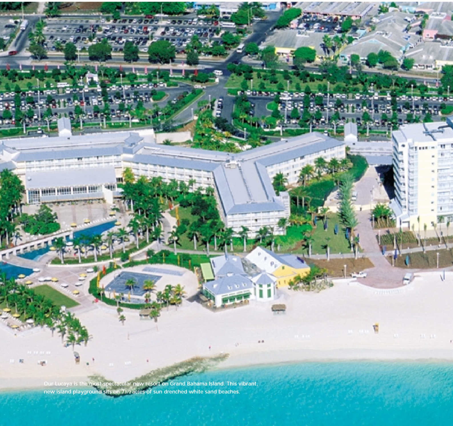
Our Lucaya is the most spectacular new resort on Grand Bahama Island. This vibrant, new island playground sits on 7 1/2 acres of sun drenched white sand beaches.