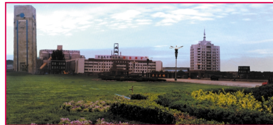
Jining III coal mine

The Company initially owned four coal mines, that is Nantun, Xionglongzhuang, Baodian and Dongtan. The Company acquired Jining II coal mine and Jining III coal mine on 1st January, 1998 and 1st January, 2001, respectively.