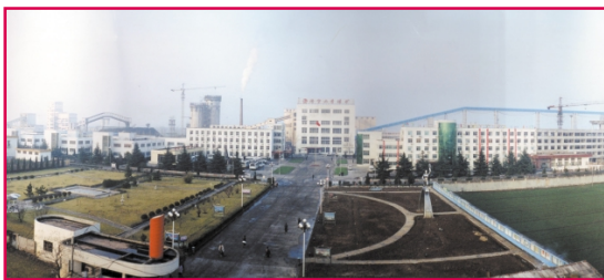
Jining II coal mine

The Company successfully developed mechanized comprehensive top caving mining method, which won the First Class National Sci-Tech Advance Award. This world class technology has significantly improved the Company's efficiency and productivity.