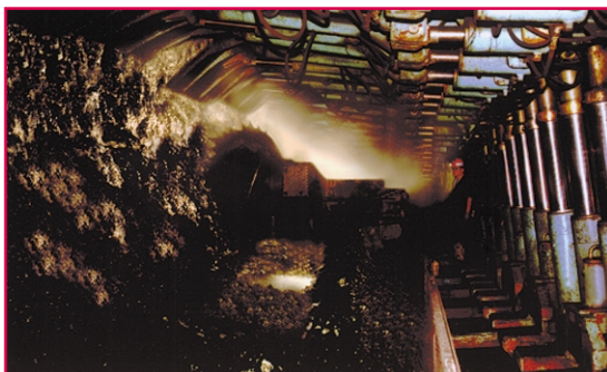
Mechanized comprehensive top caving mining method