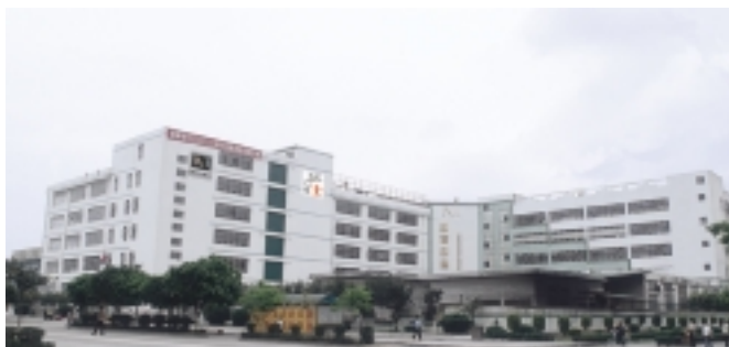
The new extension of Dongguan Plant (the block on the left) provides spacious area for storage and future expansion on production capacity to meet business growth.

In light of China entering World Trade Organization, relocation of production facilities into China were accelerated which posed strong demand on efficient and effective supply chain management for these customers. The completion of Dongguan Plant's expansion project has supplied spacious