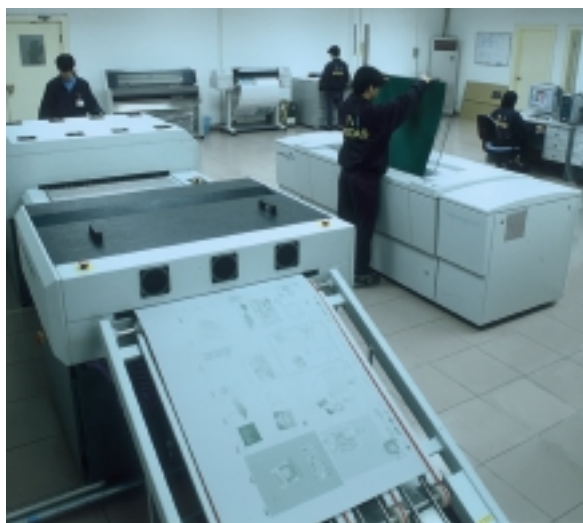
The Group has invested in state-of-the-art printing technology of computer-to-plate system which can shorten production lead-time and save cost for our customers.

Anticipating the global demand to be weakened amidst the distinct slowdown in the economy of the United States and the downward trend in pricing, we are cautiously confident of our business prospects given keen competition in the market. We will continue our efforts on cost control and processes improvement to shorten production lead-time and increase productivity. Deployment of advanced technology and continual upgrade of machinery will also make us better prepared to face the future.