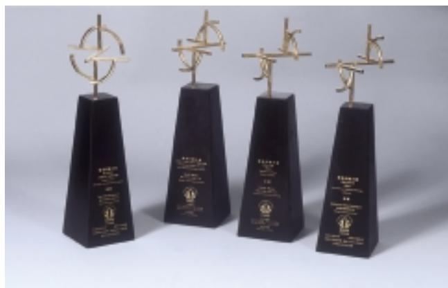
Our quality is recognized in the industry. In year 2000, we have awarded 2 champion awards and 1 merit award from The Hong Kong Print Awards and 5 Pewter awards from the The Gold Ink Awards.

Our success builds on quality. During the year, both of our Dongguan and Yuanzhou Plants have obtained ISO 9002 accreditation. Also, in December 2000, our Dongguan Plant obtained ISO 14001 accreditation from British Standards Institution to demonstrate our social responsibility to preserve the environment.