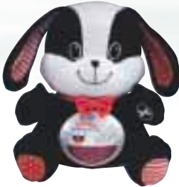
Muttzart's Symphony Sounds™