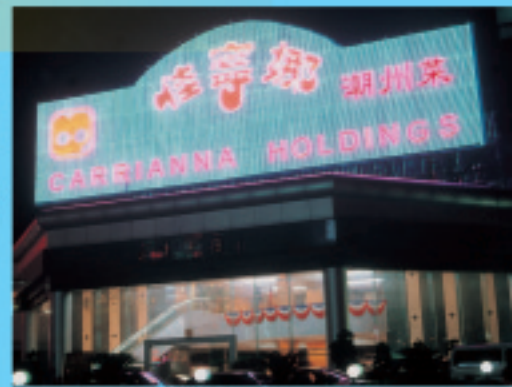
Carrianna restaurant in Chengdu.