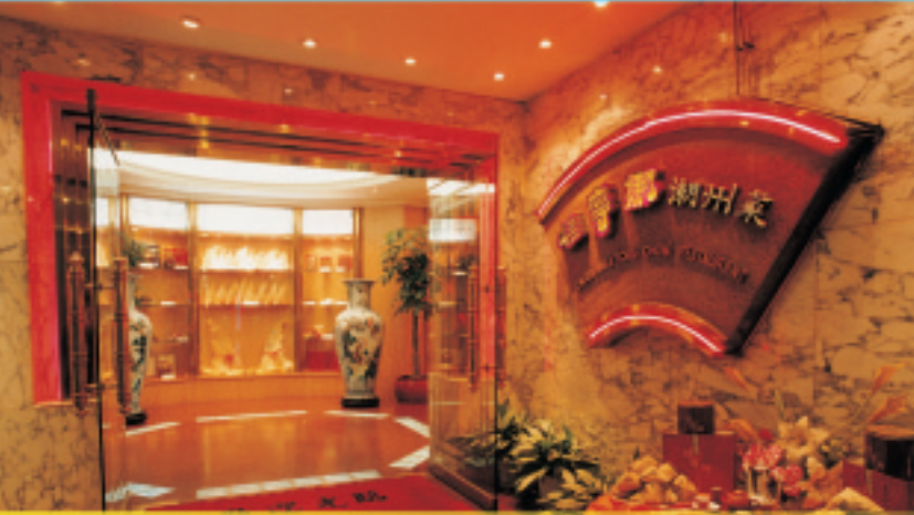
The newly renovated Carrianna restaurant at Hotel Oriental Regent, Shenzhen.