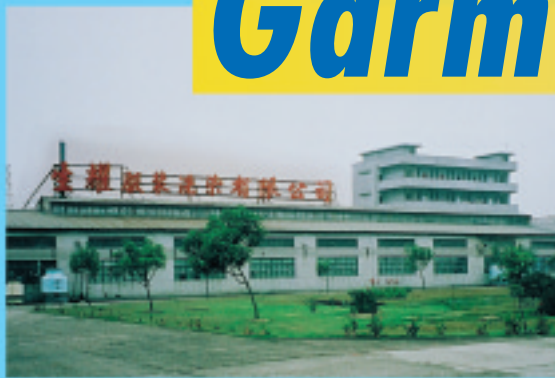
Outside view of Sunlight (Panyu) Garments and Laundry Co., Ltd. in Panyu, PRC.