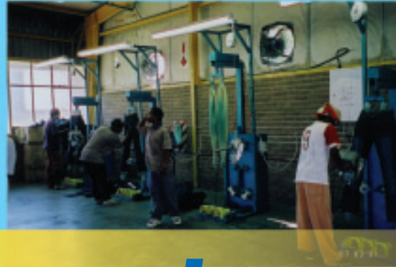
Hand Brush - Sand Blast Section in South Africa.