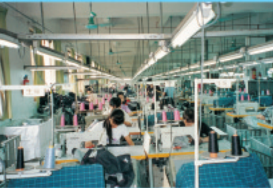
Sewing Line at factory in Panyu, PRC.