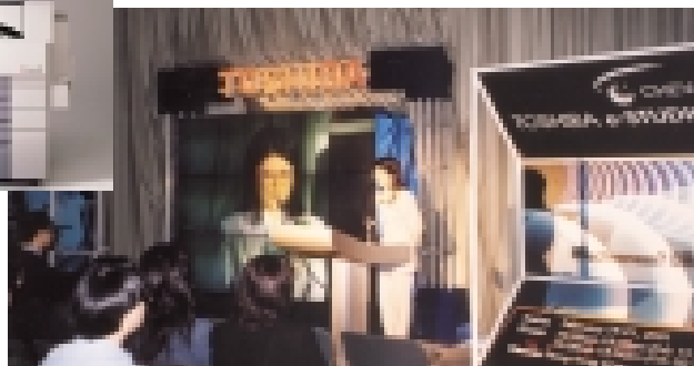
Chevalier (OA) Limited announced the launch of Toshiba e-Studio digital copiers and promotion of other Toshiba products