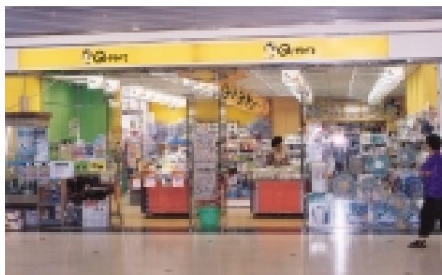
Q-Mart Shop at Tin Shui Wai

The overall performance of Q-Mart Shops was satisfactory despite losses still incurred due to the write-offs of the initial setup costs and depreciation charges. With the implementation of stringent cost control and the provision of wide range of high quality household products, it is anticipated that results will be improved in the coming year. Currently, the Group operates a total of 14 Q-Mart Shops in various locations.