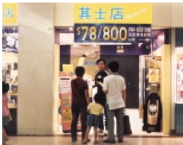
Chevalier Shop at Plaza Hollywood

The development of information technology and the improved quality of telecommunication products and services further stimulate the telecommunication market. Performance of the Telecommunication Service Division was encouraging during the year under review and revenue generated from the mobile phone retail business and related valued-added services continued to grow. Currently, the Group operates a total of 19 Chevalier Shops and 28 franchise shops. However, the market will become more difficult because of the slowdown in domestic demand and delay in the introduction of new technology.