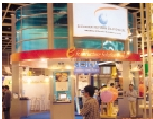
Chevalier (Network Solutions) Limited exhibited as e-frastructure solution provider in IT Expo 2000

In order to provide one-stop IT solutions and services to our customers, a new company named Chevalier (Network Solutions) Limited was established in mid-2000. The company will provide total network solutions and services including backbone networking, server/software applications, LAN/WAN solutions, PABX, peripheral equipment and security management. During the year, a major contract includes the fibre network and telephone system installation and maintenance was awarded by Television Broadcasts Limited with a contract value of approximately HK$20 million.