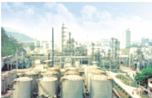
工廠一角 Part of the factory

公司地處珠江三角洲，瀕臨西江，工廠內建有碼頭，水陸交通十分便利，具有良好的生產經營環境。加上生產技術雄厚、管理嚴謹、質量領先，資金充裕、信譽良好，產品在市場上具有強大的競爭力。近年來業務不斷拓展，產量不斷提高，成為國內最大的酯類生產企業。