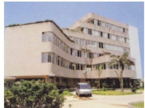
辦公大樓 Office building

Jiangmen Handsome Chemical Development Limited ("Jiangmen Handsome") is mainly engaged in the production of acetate products which include butyl acetate and ethyl acetate. Its annual production is 50,000 tonnes.