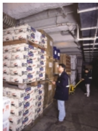
Seapower Resources Cold Storage

This division has been providing specialized storage services for climate controlled products for about 20 years to importers, traders, wholesalers and manufacturers/processors. Climate controlled products cover a wide variety of basic necessities such as frozen meats, fresh fruits, cigarettes and wines, films and pharmaceutical products. During the financial year, this division had undergone a series of rationalization exercises including upgrading its information technology systems and focusing on higher margin accounts in order to provide better return to its shareholders and more dedicated services to its customers.