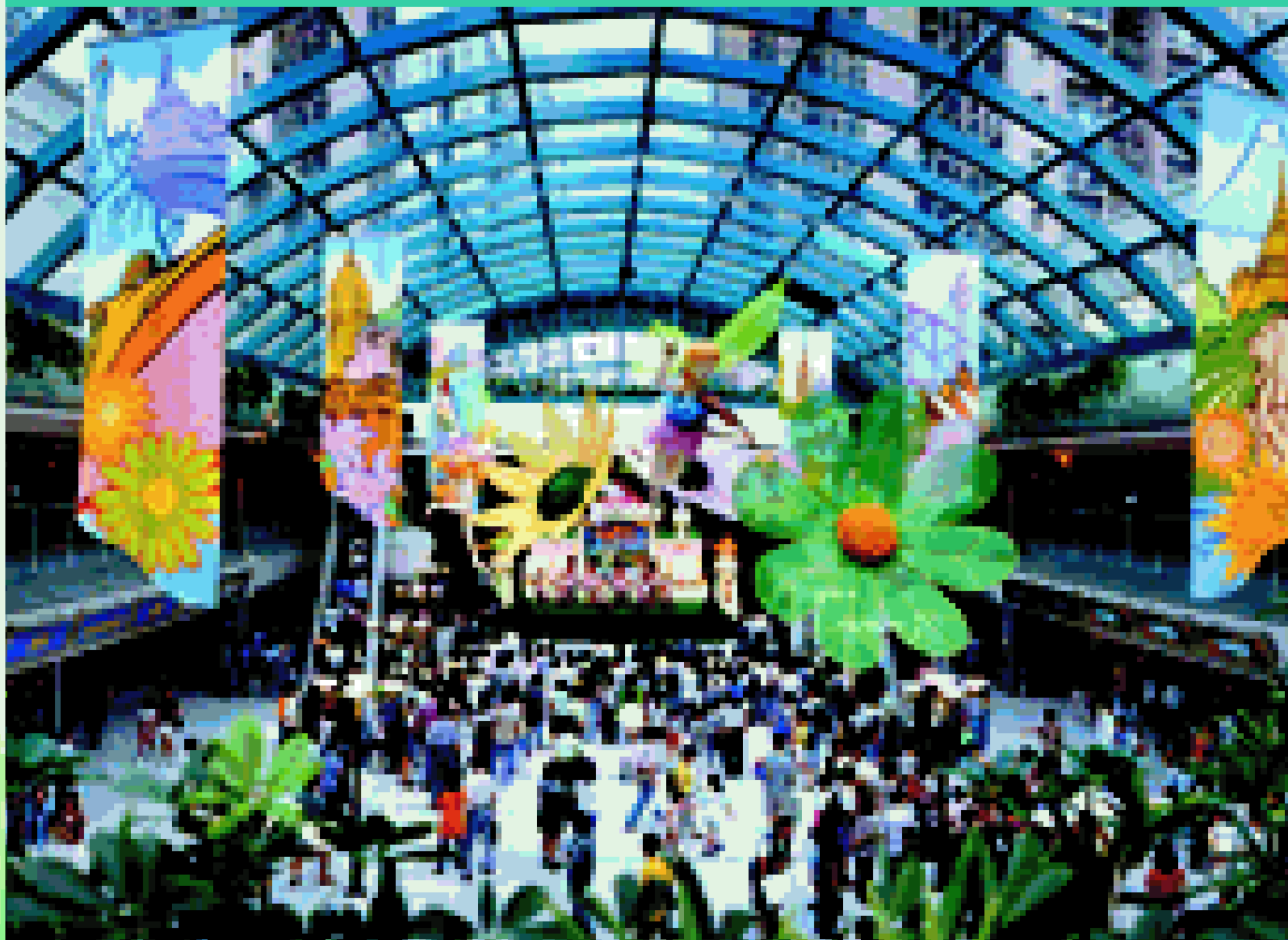
Sunshine City Plaza, Ma On Shan

Being one of the major investment properties of the Group, this spacious retail shopping arcade situates beneath the large-scale residential-cum-commercial property was completed by the Group in 1996 at the heart of Ma On Shan, N.T.. It is in close proximity to the future Ma On Shan Station of the KCRC Ma On Shan Extension Line. (The photo below shows the Ma On Shan Station under construction).