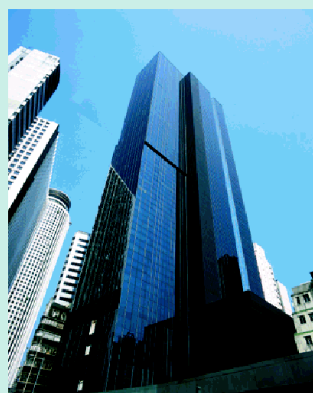
MLC Tower (formerly known as CEF Life Tower)

Completed in late 1998 for rental purpose, this 17.13%-owned 34-storey quality office building of approx. 334,900 sq.ft. in total G.F.A. is located on Queen's Road East, Wanchai, Hong Kong.