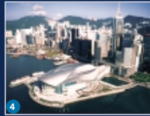
4 Hong Kong Convention & Exhibition Centre