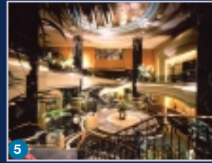
5 Grand Hyatt Hong Kong