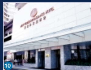
10 New World Centre - New World Renaissance Hotel