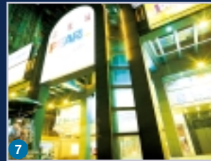
7 Pearl City