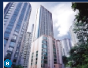
8 2 MacDonnell Road