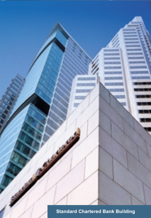
Standard Chartered Bank Building