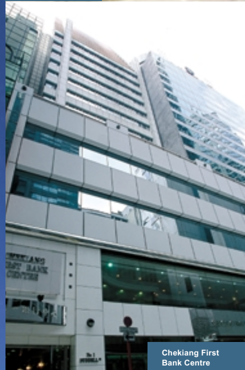
Chekiang First Bank Centre