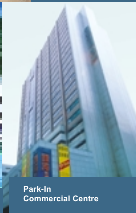
Park-In Commercial Centre