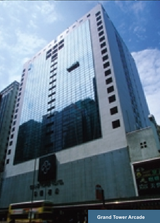
Grand Tower Arcade