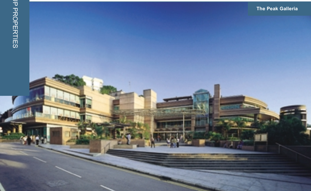
The Peak Galleria