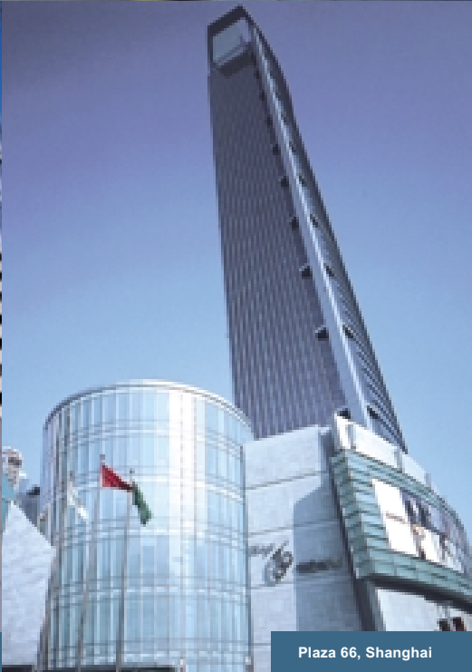
Plaza 66, Shanghai