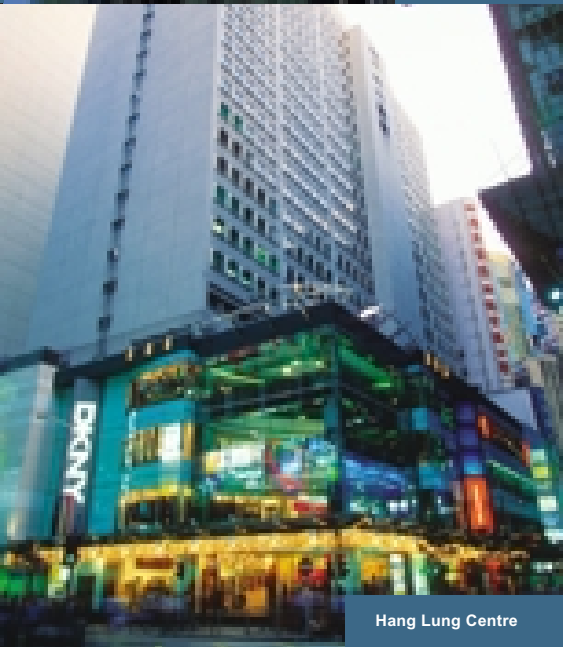
Hang Lung Centre